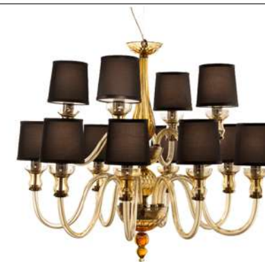
225 Chandelier (225/8+4)

Chandelier in amber carved crystal, metal with gold nickel finish and black fabric shades. Available in different dimensions and colors. Opera Classic Collection.