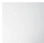
Table Finish: Glass (W/ Reflections of the Mirror)

Silver Plated Transparent Extralight Glass