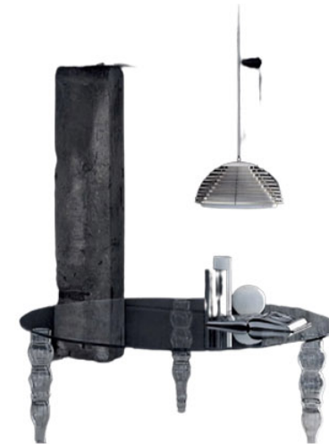
POS20/21/22/23 (With 3 Legs)

Post Modern- Series of high tables with squared, rectangular and rounded shape. The top is available in transparent, transparent extralight, acid-etched extralight, glossy lacquered or opaque lacquered glass. The feet are in molded and shaped borosilicate glass.