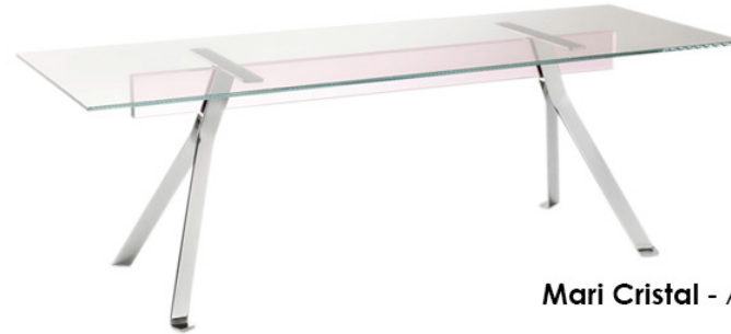
Mari Cristal - A series of rectangular dining tables.

Legs in mirror-polished stainless steel or painted in a satin bronze finish.