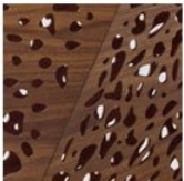
Origami Wood in Walnut