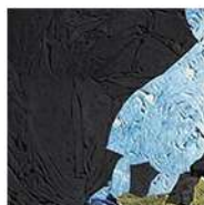
Jeans + T-Shirts