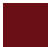
Wine Red RAL3005