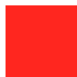
Luminous Bright Red