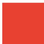
Luminous Bright Red