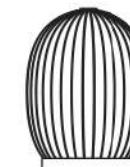
Twee T Pendant Large Lamp