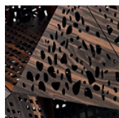
Origami Ebony Wood