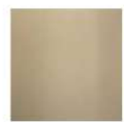
Gold Stained Aluminium