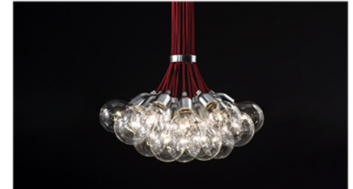
Ildes Max S7