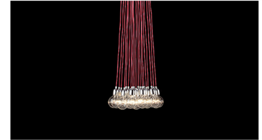
IIde Max S13