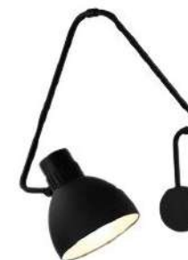
Blux System W40