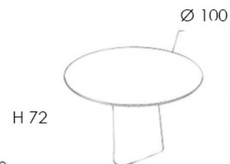
ADAM ROUND TABLE 100: H 72 - Ø 100 CM H 28.35" - Ø 39.37"