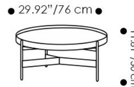
Medium Coffee Table 29.92\"/>