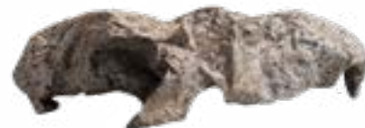
Molded TVC Panel