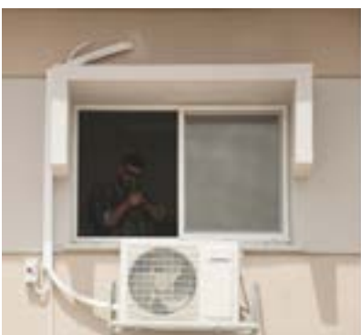
Without the kit