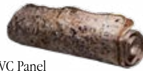
Rolled TVC Panel

The end user can manipulate the TVC to imitate any 3D object in the environment, and then fold it back into a 2D form, repeatedly.