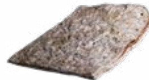
Folded TVC Panel