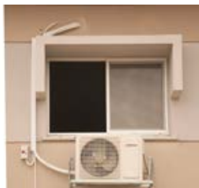
With the kit