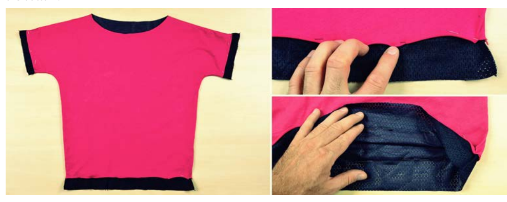
Now fold an allowance of a top material in sleeves and bottom on a lining and pin all 3 layers together (see a picture below); now it is time to trim cuffs using a function of a coverlock stitching; a seam is applied 1.5cm from the edge and should include all 3 layers, closing the edge of a lining inside a cuff; additionally you can baste all edges together, to make sewing with coverlock easier.