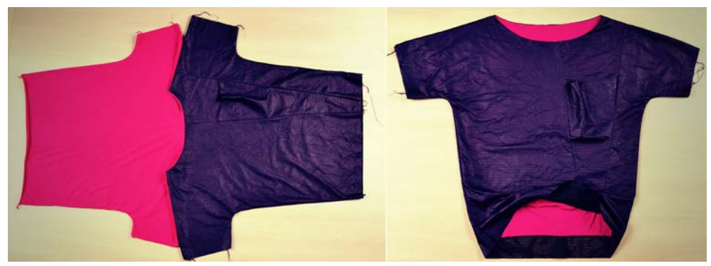
Turn a whole tunic to a left side and pin the edges of a lining with a top material within sleeves and at the bottom.