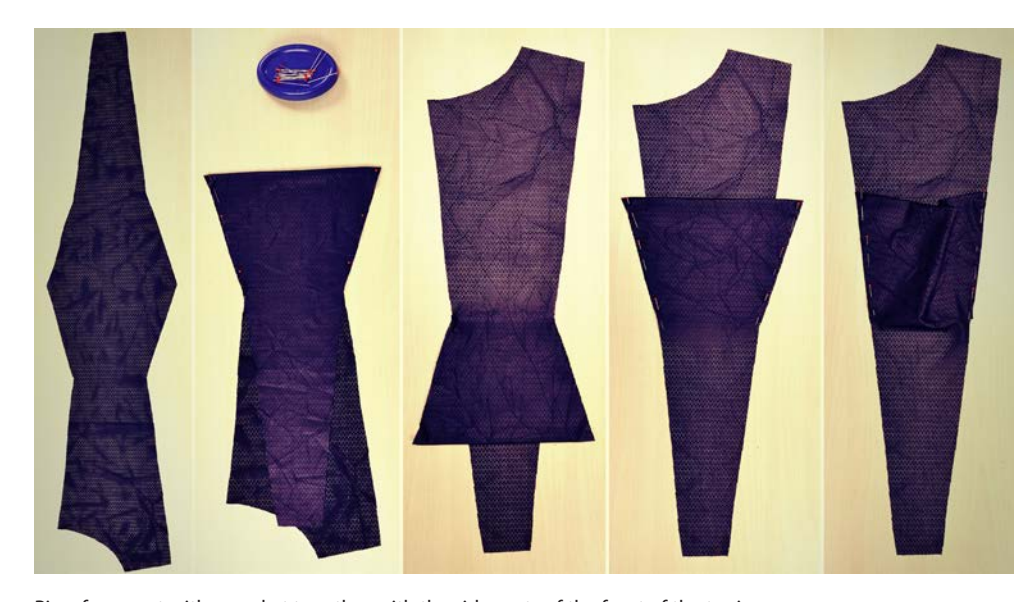
Pin a fragment with a pocket together with the side parts of the front of the tunic.

Pin a pocket. Put the middle part of front on the table with left side of a material up; fold it in half at its widest part, turning up a narrower part to a right side; pin edges of a pocket; turn the whole element with a pinned pocket to a right side; place a pinned pocket on the upper part of the element; pin the protruding edges of a pocket with the edges of the upper part. Ready! A pocket will look like that after sewing it up.