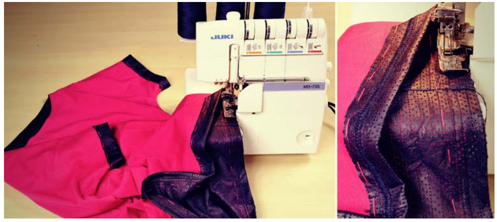
Now it is time for a precise task – you must cut an excess of a material; if you want to avoid it and make a seam so as to cover the edge of a material with a cover-stitch, add smaller allowances on cuffs or cut them before sewing; but then you can't make any mistake; you need to carefully baste the edge of a cuff and sew on a right side, exactly in the place where a material ends underneath.