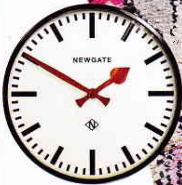
Time's up Newgate UK Nottingham wall clock, $345, Scout House, 45cm diameter x 9cm depth.