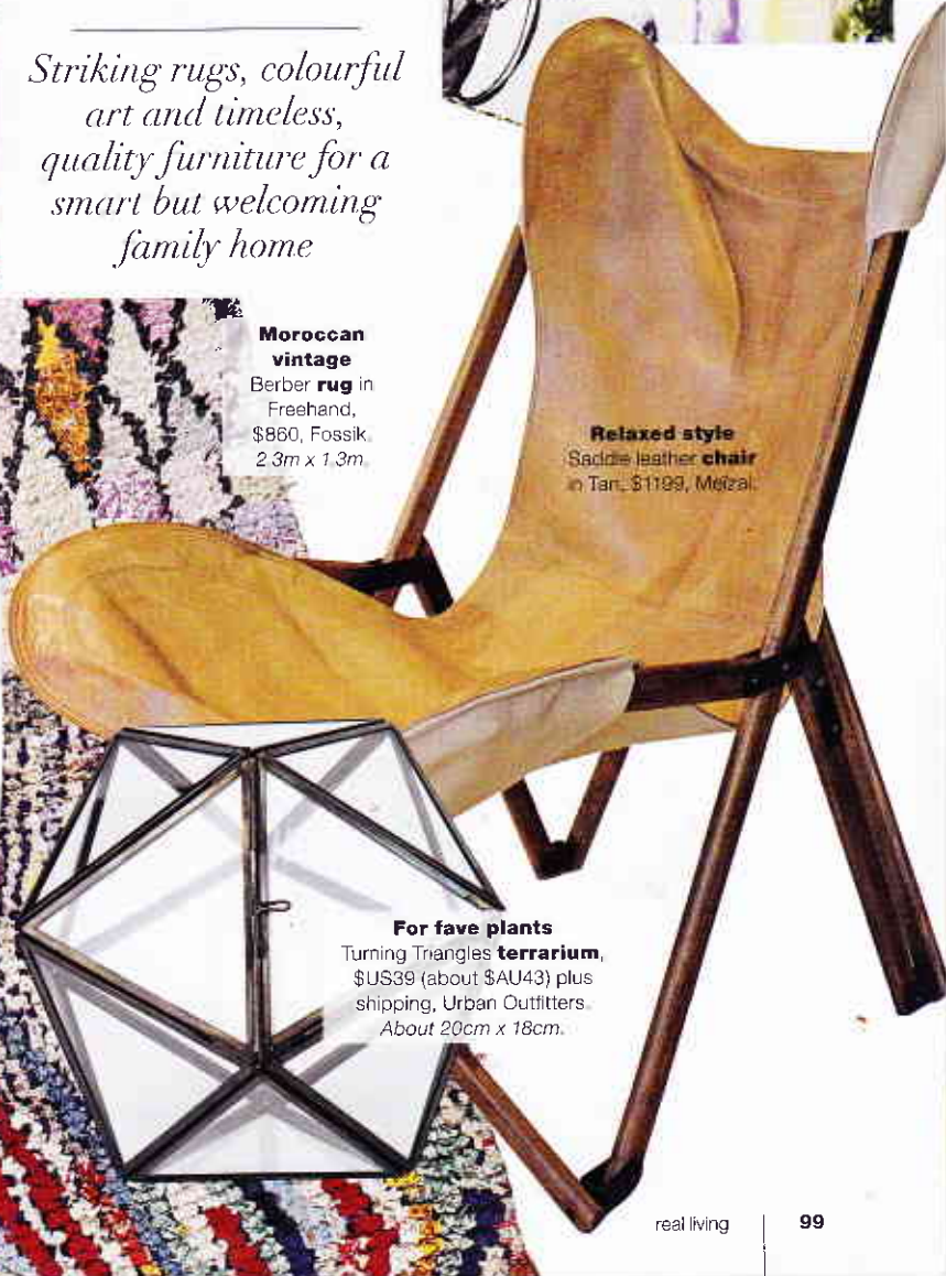
For fave plants Turning Triangles terrarium, $US39 (about $AU43) plus shipping, Urban Outfitters, About 20cm x 18cm.