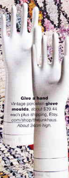
Give a hand Vintage porcelain glove moulds, about $39.44 each plus shipping, Etsy.com/shop/thejunkhaus, About 34cm high.