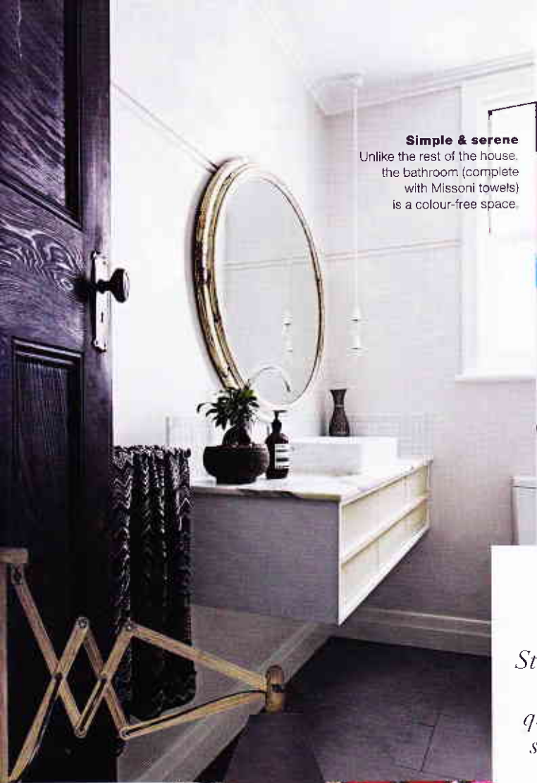
Simple & serene Unlike the rest of the house, the bathroom (complete with Missoni towels) is a colour-free space.