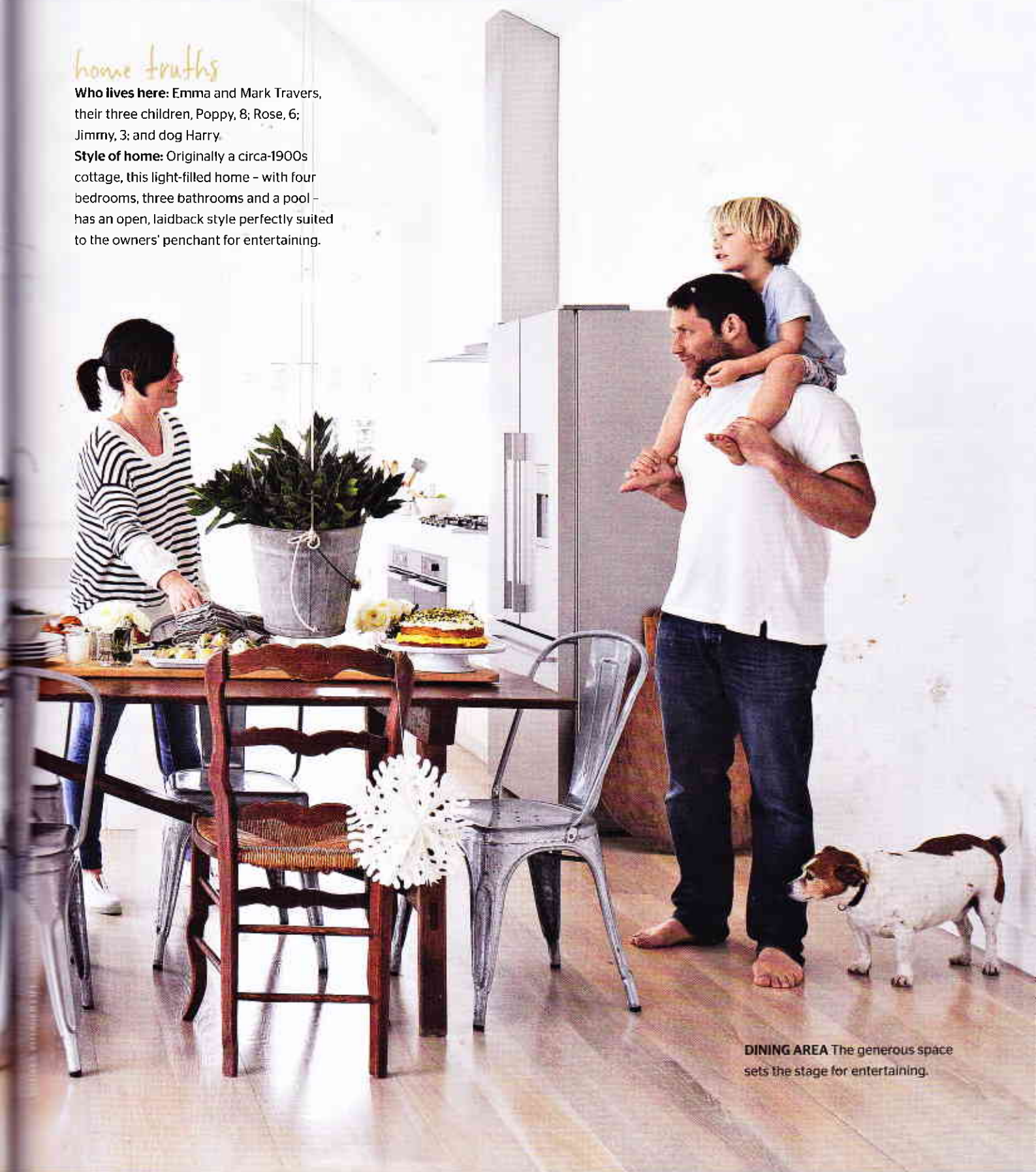
DINING AREA The generous space sets the stage for entertaining.

Style of home: Originally a circa-1900s cottage, this light-filled home - with four bedrooms, three bathrooms and a pool - has an open, laidback style perfectly suited to the owners' penchant for entertaining.