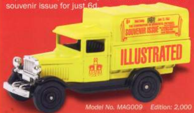
Model No. MAG009 Edition: 2,000

Afterwards, everybody made their way to St James Park and watched the Royal Family on the balcony waving to the Fly Past. These moments were all captured for posterity by the Illustrated in their souvenir issue for just 6d.