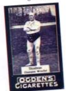
A collectors card from an early pack of OGDENS Cigarettes. Could this be a youthful Dusty?