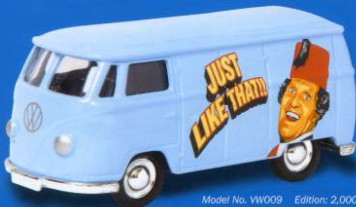
Model No. VW009 Edition: 2,000