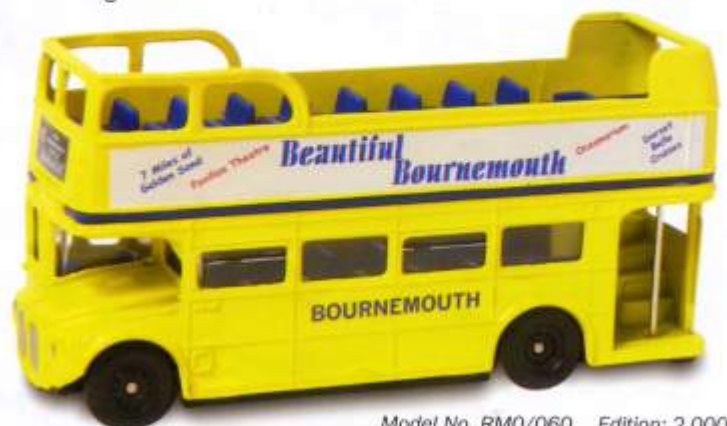
Model No. RM0/060 Edition: 2,000

Today it is a thriving and exciting university town with more than 160,000 residents. Our Routemaster Bus makes a lovely addition to the range.