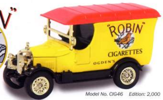
Model No. CIG46 Edition: 2,000