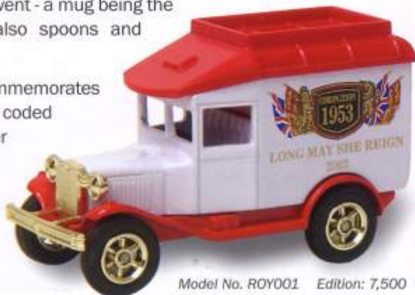
Model No. ROY001 Edition: 7,500

Our Model A commemorates the event and is coded ROY001 - Further releases are scheduled in this range over the coming months.