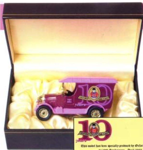
Model No. 219G Edition: To be decided

Certificate that will come with model that will carry your name and membership number.