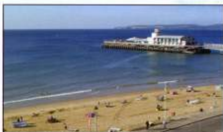
A lovely and relaxing view to be found at Bournemouth

Just a few hundred years ago this little fishing village was synonymous with smuggling brandy, silk and gin. It was Captain Louis Tregonwell who changed all this after holidaying