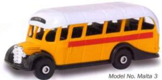
Model No. Malta 3

Another trip down memory lane and this time it features one of the smaller of the four groups created by the Railways Act of 1921. They had a virtual monopoly over the South of England. As you can expect being in the South it suffered heavily during World War II and were stretched to