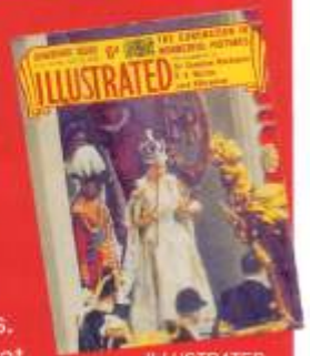
ILLUSTRATED Coronation edition

Just over a week after the Coronation we all had a chance to relive the moments in colour. For many the event a week earlier had been enjoyed either on the radio or the black and white TV. This was a chance for the excitement to continue and to discuss our favourite moments. For many it was the sight of that gold coach pulled by all those horses, for others the Queen with her crown, orb and sceptre.