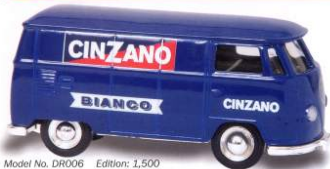
Model No. DR006 Edition: 1,500

The Cinzano brand can be dated back to the fifteenth century with Antonio Cinzano, an Italian property owner of the oldest vermouth producing house. Apparently the term 'Vermouth' comes from the German word, 'Vermud' for the herb wormwood. It was in 1925 that the famous red and blue logo was introduced - the red symbolising passion, pride and vivacious radiance. The blue representing nobility, tradition and the depth of the Mediterranean.