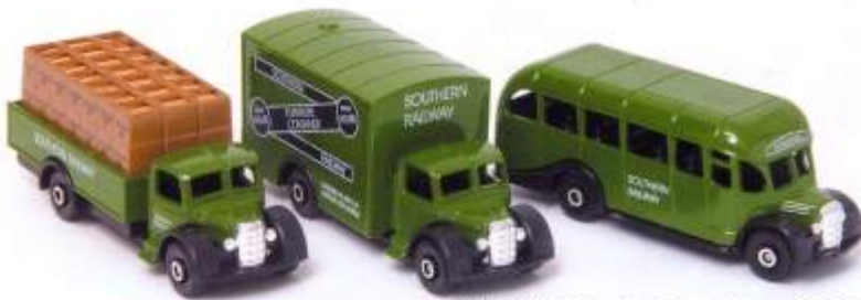
Model No. SET No 11 Edition: 2,000