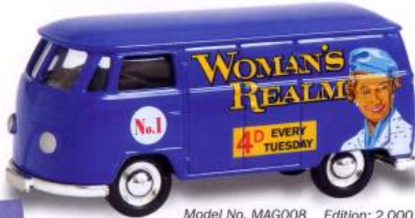
Model No. MAG008 Edition: 2,000

This VW will go down particularly well with all our lady members as it features that ever so popular 'woman's' magazine from the 1950's - Woman's Realm. It was at this time that many new titles hit the shelves all ready to discuss the issues of the day such as - "A Man's Place is in the Home". They even went on to discuss what a husband will and won't do about the house - Taff was absolutely horrified when he