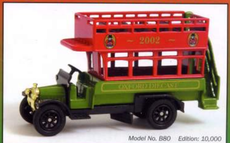
Model No. B80 Edition: 10,000