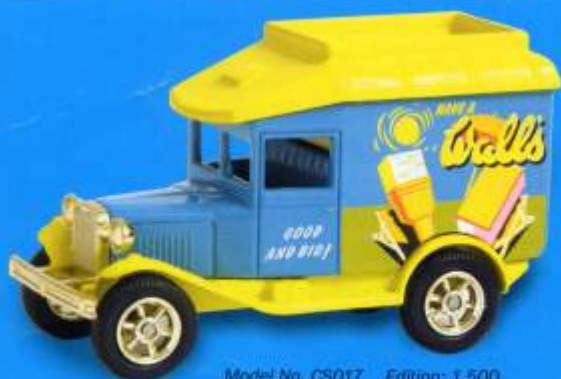
Model No. CS017 Edition: 1,500

We only have limited numbers of the crazed version left and will honour the offer until they are exhausted.