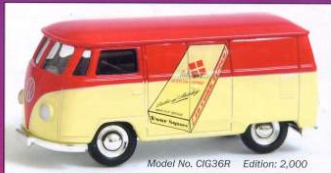
Model No. CIG36R Edition: 2,000

Once we were aware of this we stopped shipment to collectors, but we are now in a position to release them again. The background to this also gave us a bit of a problem because when we asked some of our members to return their crazed model for replacement they declined to do so, as they wished to retain them for their collections. So we decided to issue the corrected model coded as CIG36R. For all those who order the CIG36R we will give them the option to purchase also the CIG36 (crazed version) for £2.50. Anyone who already has the crazed version CIG36 we will give the option to purchase the CIG36R (corrected version) at £2.50.