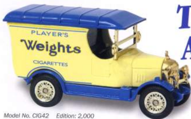
Model No. CIG42 Edition: 2,000