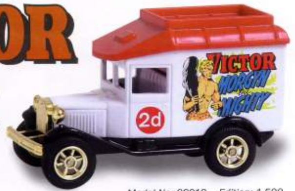
Model No. CC018 Edition: 1,500

The Victor first hit the shelves back in 1961 and after over 1600 issues the final comic was issued in 1992. The first issue came with a squirt ring - I do remember these so fondly - a simple device for giving your best pal a wet shirt. "The Tough of the Track" was my favourite strip which told the story of Alf Tupper who had all the qualities any top athlete could wish for: working class background, firm grasp of non-standard English, steady job (welding beneath the railway arches), economical and unvaried diet (fish and chips), and a complete disrespect for authority whether British or Eastern European. His long running career spanned at least the 1950s (the earliest race was in prose in the 1957