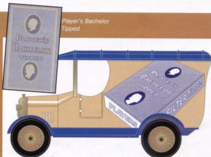
Player's Bachelor Tipped