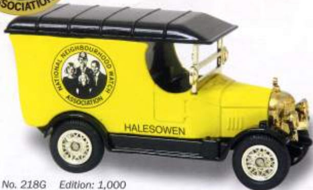
Model No. 218G Edition: 1,000

Neighbourhood Watch is the country's largest voluntary organisation with over 133,000 schemes involving more than 10 million people. It is relatively new in the UK with the first scheme starting in Millington, Cheshire in July 1982. Watching and caring - not snooping is what it's all about. Neighbours uniting and acting together means that dozens of eyes and ears are ready to pick up on anything happening in the neighbourhood that could cause worry or concern. It's not about being nosy or interfering, it's about being a good neighbour and caring about your community. By working together, neighbours can help reduce all sorts of local crimes. They can also take action to improve the environment by getting something done about things like vandalism, graffiti, poor lighting and a lack of local amenities. As well as making the neighbourhood a better place to live and work in, tackling local problems and concerns will help people to feel less nervous about crime - especially those who are elderly or vulnerable for other reasons. This Bullnose was specially commissioned by the organisation for Halesowen.