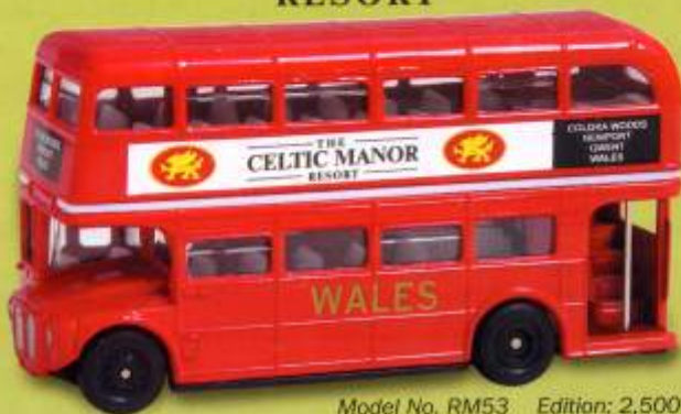
Model No. RM53 Edition: 2,500

It was back in Globe 15 that we released our first Celtic Manor models. There were four in total. To add to these models we are introducing a Routemaster the RM53. The hotel has now been renamed The Celtic Manor Resort as it boasts a whole range of activities including three championship Golf courses. It will also be the venue for the Ryder Cup in 2010 so all you Golf fanatics will be seeing plenty of it in the future. The previous models produced are listed below and we only have stock left of the Bullnose.