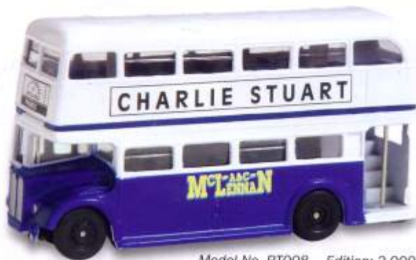
Model No. RT008 Edition: 2,000

Thanks also for the many recent ideas you've sent me - keep them coming in. Taff