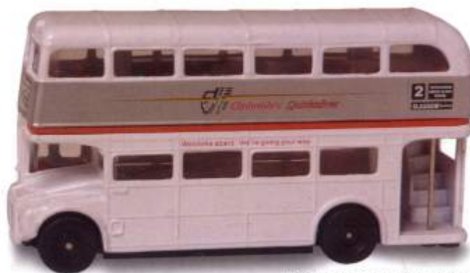
Model No. RM47 Edition: 2000

Our RM is seen on the Glasgow route and appears to be the first and only RM owned by Clydeside Scottish. They must have liked it though as it spent eight years north of the border before returning south to London Country. They weren't quite so keen however and after a very short time shipped her off to South America.