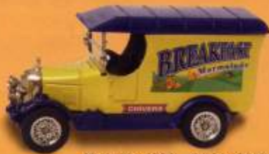
Model No. 176G Edition: 2000