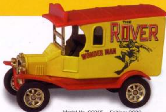
Model No. CC015 Edition: 2000

Rod did not answer. He went into a small cave. When he reappeared he was wearing the suit of a frogman. On his back an oilskin haversack was strapped. Ice-pick and piton hammer were attached to his belt. For a few