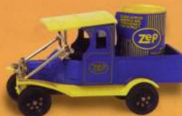
Model No. 090TU Edition: 2000