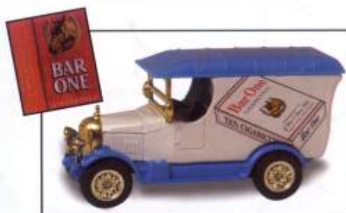
Model No. CIG 034 Edition: 2000

These are now 36 models in the cigarette series.