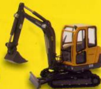
Model No. EC45