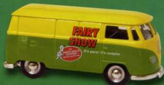
Model No. CS014 Edition: 1500