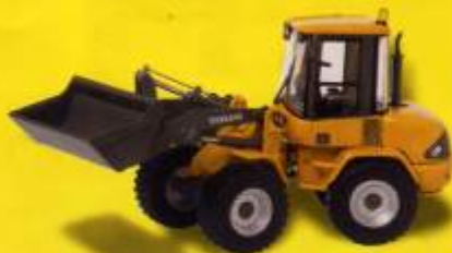
Model No. L30B