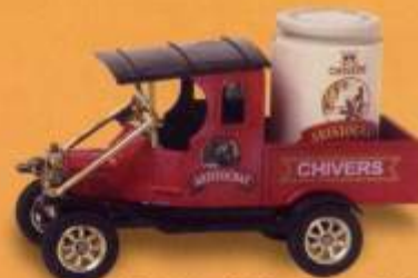
Model No. 107TG Edition: 2000