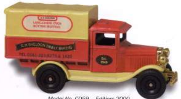
Model No. C059 Edition: 2000