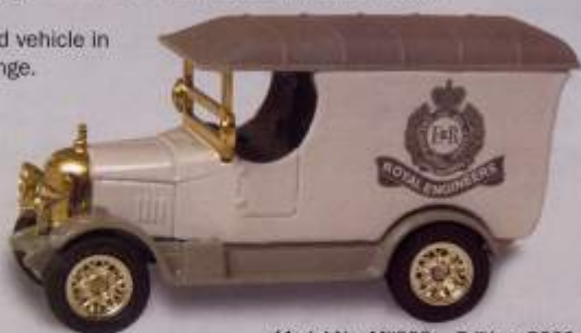
Model No. MII003 Edition: 2000

This is the third vehicle in the Military range.