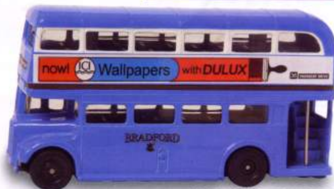
Model No. RT004 Edition: 2000