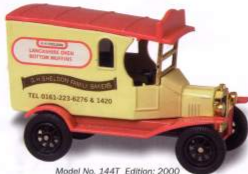
Model No. 144T Edition: 2000

A lovely Model T and a delightful Chevrolet are the new editions.