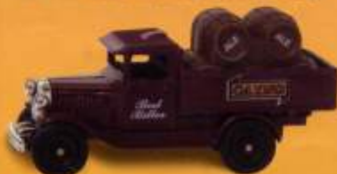
Model No. C034 Edition: 2000