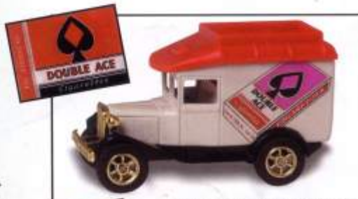
Model No. CIG 035 Edition: 2000