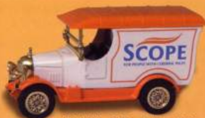
Model No. 115G Edition: 2000