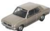
Ford Cortina MKII 76COR2001