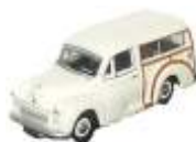
Morris Minor Traveller 76MMT001