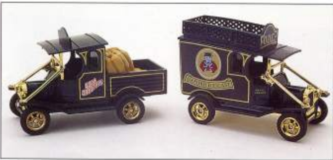
The Soda Crystals edition is produced in blue and white, not black as illustrated

The Christmas van this year is also a Model T. Of course, as the new releases are available, you'll be kept informed.