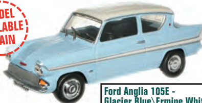
Ford Anglia 105E - Glacier Blue/Ermine White CR025 SCALE 1:43 PRICE £6.95