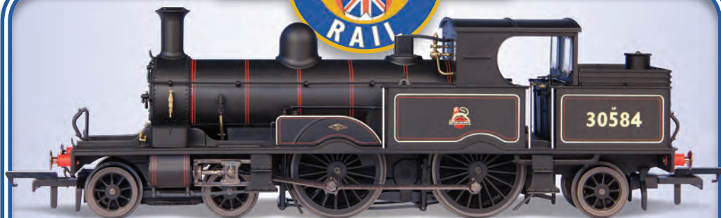
OR76AR002 - 1:76 - £99.95

BR (Early) 4-4-2T Class 0415 Adams Radial No. 30584