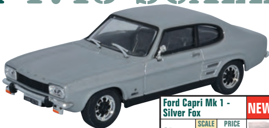
Ford Capri Mk 1 - Silver Fox NEW CR041 SCALE 1:43 PRICE £6.95