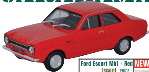
Ford Escort Mk1 - Red NEW CR042 SCALE 1:43 PRICE £6.95