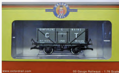
OR76MW7012 - 1:76 - £8.95