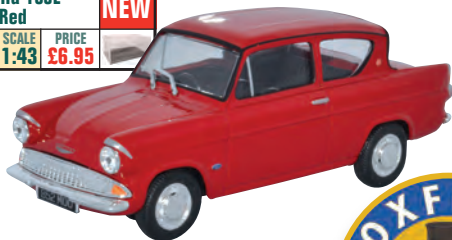
Ford Anglia 105E - Monaco Red NEW CR040 SCALE 1:43 PRICE £6.95