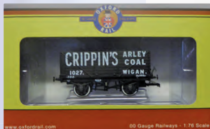
OR76MW7011 - 1:76 - £8.95

BR (Early) 4-4-2T Class 0415 Adams Radial No. 30584