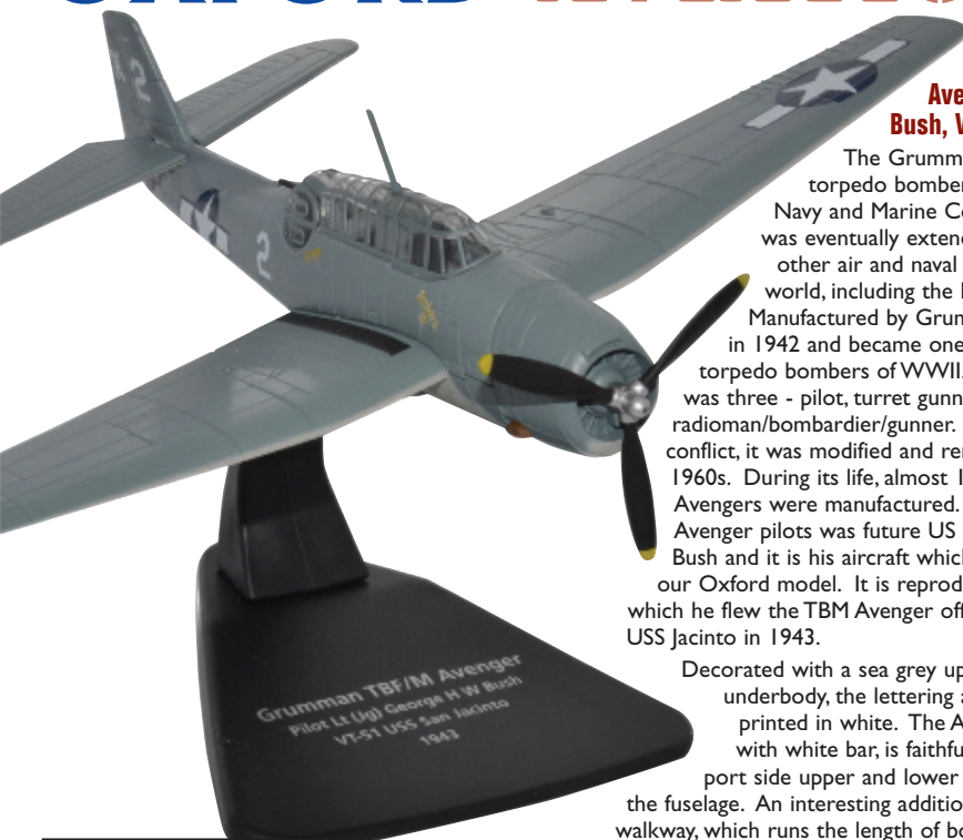
Grumman TBF/M Avenger - George HW Bush, VT51 USS Jacinto 1943

The Grumman TBF Avenger was a torpedo bomber developed for the US Navy and Marine Corps, although its use was eventually extended for use by several other air and naval services round the world, including the Royal Navy. Manufactured by Grumman, it entered service in 1942 and became one of the outstanding torpedo bombers of WWII. The crew complement was three - pilot, turret gunner and radioman/bombardier/gunner. After the end of the conflict, it was modified and remained in use into the 1960s. During its life, almost 10,000 Grumman Avengers were manufactured. One of the notable Avenger pilots was future US President George H W Bush and it is his aircraft which is now the subject of our Oxford model. It is reproduced in the livery in which he flew the TBM Avenger off the light aircraft carrier USS Jacinto in 1943.