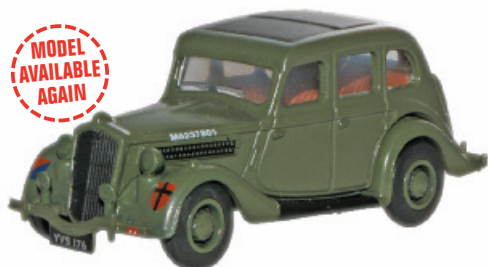
Wolseley 18/85 - British Army