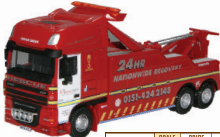
DAF Recovery - Hough Green