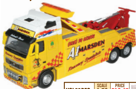
Volvo Recovery - A1 Marsden