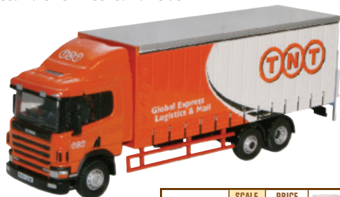
Scania 94 6 Wheel Curtainside - TNT