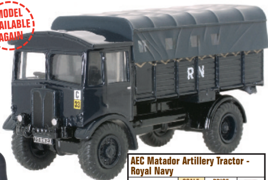
AEC Matador Artillery Tractor - Royal Navy