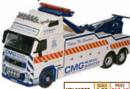
Volvo FH Recovery Truck - CMG