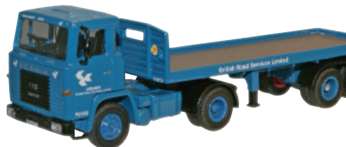
Scania 110 Flatbed - BRS