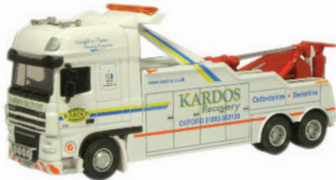
DAF Recovery - Kardos