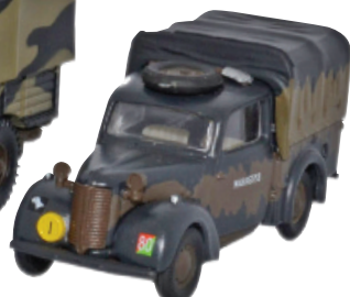
Military Set - Italy 1943