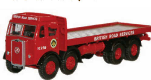
Atkinson 8 Wheel Flatbed Lorry - BRS