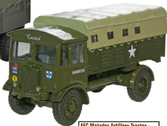
AEC Matador Artillery Tractor - British Army