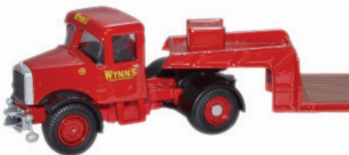
Scammell Highwayman Low Loader - Wynns