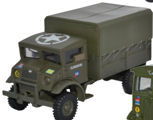
CMP - 3rd Canadian Inf Div NW Europe 1945