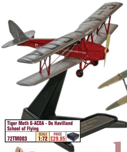
Tiger Moth G-ACDA - De Havilland School of Flying