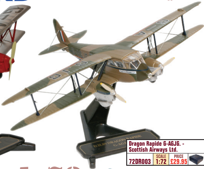
Dragon Rapide G-AGJG - Scottish Airways Ltd.