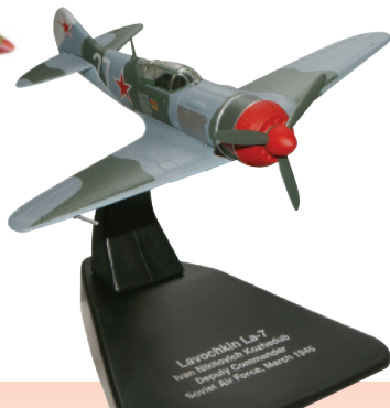
Lavochkin La-7 Ivan Nikitovich Kozhedub