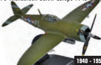
AC063 P47D Thunderbolt USAAF Europe 1943