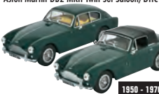
43SET32 DUE Q2/2017 Aston Martin DB2 MKII Twin Set Saloon/DHC