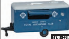
NTRAIL002 Mobile Trailer RAC