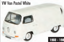
76VW013 VW Van Pastel White