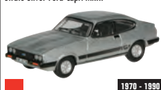
76CAP001 Strato Silver Ford Capri MkIII