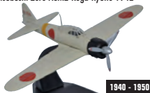
AC053 Mitsubishi Zero A6M2 Koga Ryuho 1942