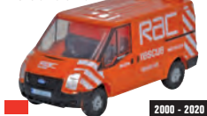
NFT003 RAC Ford Transit Van