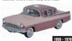
76CRE008 Vauxhall Cresta Dusk Rose/Lilac Haze