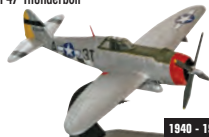
AC032 P47 Thunderbolt