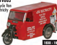
76TV005 Tricycle Van Electricity