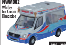
NVWM002 Whitby Ice Cream Dimascios