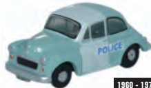
NMOS005 DUE Q2/2017 Morris Minor Saloon Police Panda