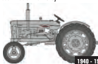
NTRAC004 DUE Q1/2018 Fordson Tractor Matt Grey