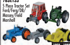
76SET33 5 Piece Tractor Set Ford/Ferg/DB/Massey/Field Marshall