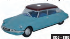
76CDS005 DUE Q1/2018 Citroen DS19 Monte Carlo Blue/Aubergine