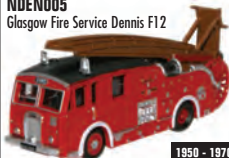
NDEN005 Glasgow Fire Service Dennis F12