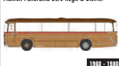
76PAN006 DUE Q3/2017 Plaxton Panorama Bere Regis & District