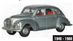
NJJ005 Athena Grey Jowett Javelin