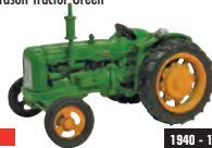
76TRAC002 Fordson Tractor Green