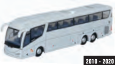
NIRZ005 Irizar PB White