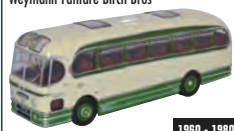
76WFA006 DUE Q2/2017 Weymann Fanfare Birch Bros