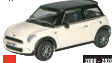
76NMN002 Pepper White New Mini