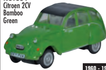
NCT004 Citroen 2CV Bamboo Green