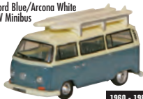
NVW003 Fjord Blue/Arcona White VW Minibus