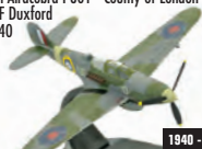
AC071 Bell Airacobra I 601 - County of London Sqn. RAF Duxford 1940