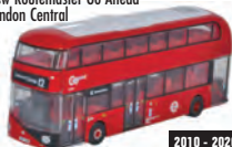
NNR002 New Routemaster Go Ahead London Central