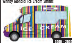
76WM006 DUÉ Q3/2017 Whitby Mondial Ice Cream Smiths