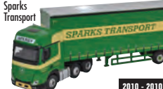
76MB006 DUE Q3/2017 Mercedes Actros GSC Curtainside Sparks Transport