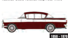
76CRE009 DUE Q1/2018 Vauxhall Cresta Venetian Red/Polar White