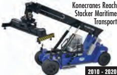
76KRS006 Konecranes Reach Stacker Maritime Transport