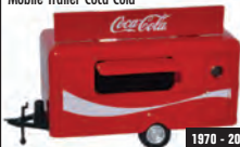
76TR015CC Mobile Trailer Coca Cola