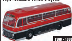
76DR004 DUE Q3/2017 Duple Roadmaster Bamber Bridge MS