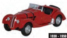
76BM28002 DUE Q3/2017 BMW 328 Red