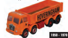
NFG010 DUE Q3/2017 Foden FG Tipper Hoveringham