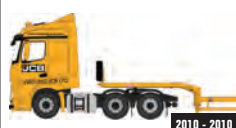
76MB010 DUE Q4/2017 Mercedes Actros Semi Low Loader JCB