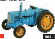
76TRAC001 Fordson Tractor Blue