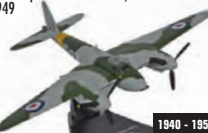
AC067 DH Mosquito FB VI 204 AFS, Brize Norton 1949