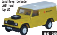
NDEF007 Land Rover Defender LWB Hard Top BR