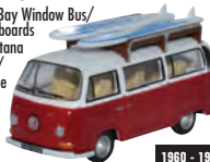
76VW024 VW Bay Window Bus/ Surfboards Montana Red/ White