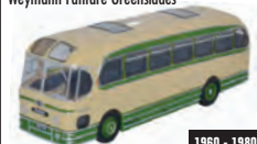
76WFA005 DUE Q3/2017 Weymann Fanfare Greenslades