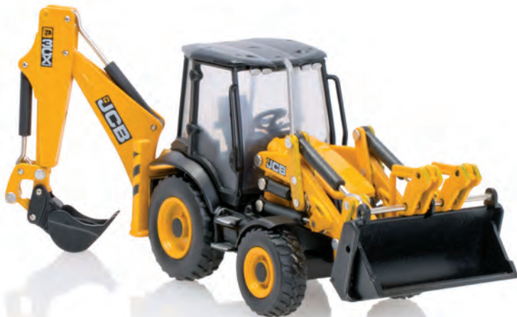
763CX001 JCB 3CX Eco Backhoe Loader