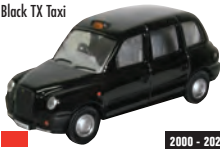
76TX4001 Black TX Taxi