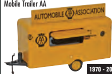
76TR010 Mobile Trailer AA