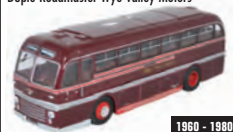
76DR003 DUE Q3/2017 Duple Roadmaster Wye Valley Motors