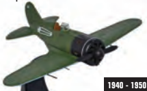
AC065-94 Polikarpov Chinese Air Force