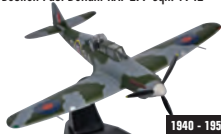
AC058 Boulton Paul Defiant RAF 277 Sqn. 1942