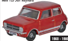
76MINGT001 Mini 1275GT Reynard