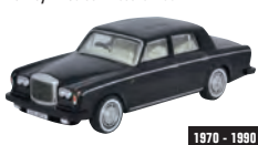
76BT2003 Bentley T2 Saloon Masons Black