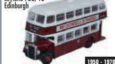
76PD2005 DUE Q3/2017 Leyland PD2/12 Edinburgh