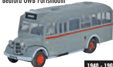
NOWB003 Bedford OWB Portsmouth