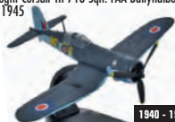
AC070 Vought Corsair III 718 Sqn. FAA Ballyhalbert NI 1945