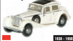
NJSS001 Cream SS Jaguar