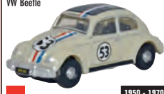
NVWB001 VW Beetle