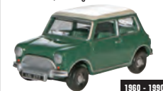
76MN003 Almond Green/Old English White Austin Mini