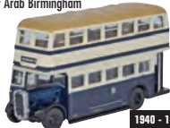
NUTO04 Guy Arab Birmingham