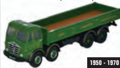
NFG009 DUE Q3/2017 Foden FG 8 Wheel Dropside H E Payne