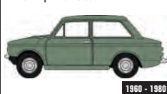
NHI001 DUE Q1/2018 Hillman Imp Willow Green