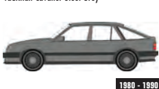
76CAV003 DUE Q1/2018 Vauxhall Cavalier Steel Grey