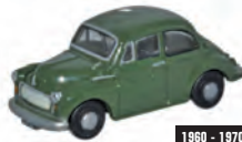
NMOS004 Morris Minor Saloon Almond Green