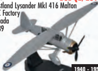
AC072 DUE Q2/2017 Westland Lysander Mk1 416 Malton NSC Factory Canada 1939