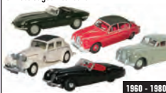
76SET14A DUE Q4/2017 5 Piece Jaguar Collection