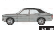
76COR3008 DUE Q1/2018 Ford Cortina MkIII Strato Silver