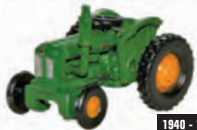
NTRAC002 Green Fordson Tractor