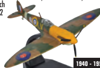
AC066 Spitfire Mk1 57 OTU, RAF Hawarden, March 1942