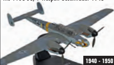
AC051 Me 110G JG/1 Wespen Geschwader 1943