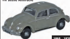
NVWB004 VW Beetle Anthracite