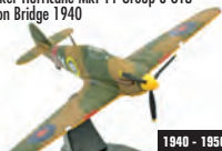
AC069 Hawker Hurricane Mk1 11 Group 6 OTU Sutton Bridge 1940