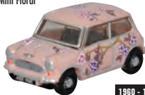
NMN006 DUE Q2/2017 Mini Floral