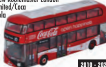
NNR004CC DUE Q2/2017 New Routemaster London United/Coca Cola