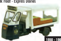
76WE001 Milk Float - Express Dairies