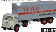
76L0001 DUE Q4/2017 Leyland Octopus Box Trailer Tesco