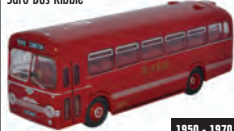
76SB001 DUE Q3/2017 Saro Bus Ribble