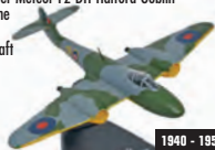
AC068 Gloster Meteor F2 DH Halford Goblin Engine Test Aircraft