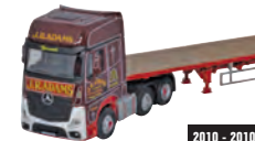
76MB003 Mercedes Actros GSC Flatbed Trailer J R Adams