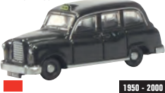
NFX4001 FX4 Taxi Black