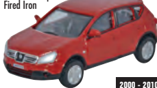
76NQ003 Nissan Qashqai Fired Iron