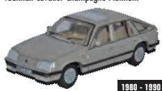
76CAV001 Vauxhall Cavalier Champagne Platinum