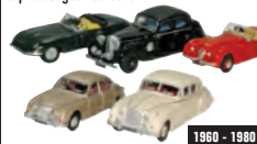
76SET14 5 piece Jaguar Collection