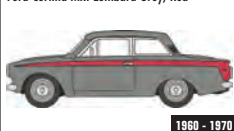
76COR1008 DUE Q1/2018 Ford Cortina MkI Lombard Grey/Red