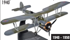
AC064 Fairey Swordfish Mk1 HMS Furious, Narvik 1940