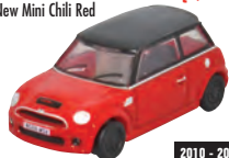
NNM001 DUE Q3/2017 New Mini Chili Red