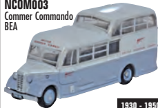
NCOM003 Commer Commando BEA