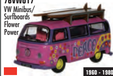
76VW017 VW Minibus/ Surfboards Flower Power