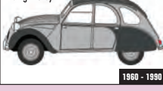
76CT006 DUE Q1/2018 Citroen 2CV Charleston Cormorant Grey/ Midnight Grey