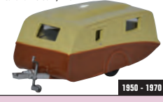
76CV003 Caravan Cream/Brown