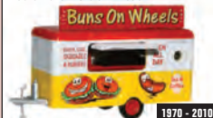
NTRAIL006 DUE Q1/2018 Mobile Trailer Buns on Wheels