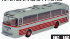
76PAN005 Plaxton Panorama Sheffield United Tours