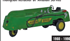
76TRF001 Thompson Refueller BP Aviation Service