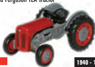
76TEA002 Red Ferguson TEA Tractor