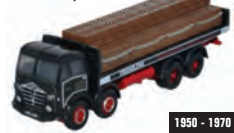
NFG011 DUE Q3/2017 Foden FG Dray Fremmins