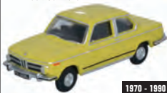
76BM02002 DUE Q3/2017 BMW 2002 Golf Yellow