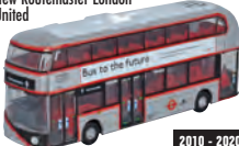
NNR003 DUE Q2/2017 New Routemaster London United