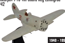
AC049 Polikarpov I-16 4th Guard Reg Leningrad 1942