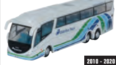
NIRZ003 Irizar PB Ulsterbus