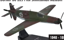
AC048 Dornier Do 335 Pfeil Smithsonian Museum