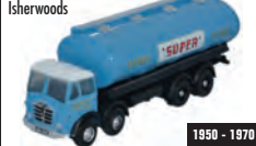
NFG012 DUE Q3/2017 Foden FG Oval Tanker Isherwoods