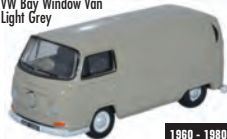
76VW026 DUÉ Q3/2017 VW Bay Window Van Light Grey