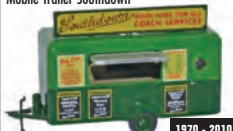
76TR014 DUE Q2/2017 Mobile Trailer Southdown