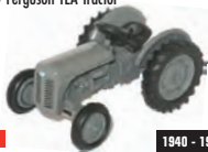
76TEA001 Grey Ferguson TEA Tractor