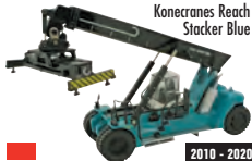
76KRS001 Konecranes Reach Stacker Blue