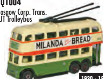
NQ1004 Glasgow Corp. Trans. BUT Trolleybus