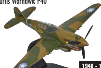
AC074 DUE Q3/2017 Curtis Warhawk P40