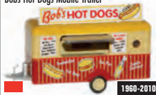
76TR001 Bobs Hot Dogs Mobile Trailer