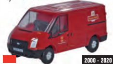
NFT002 Royal Mail Ford Transit Van