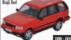
76P38001 DUE Q3/2017 Range Rover P38 Rioja Red