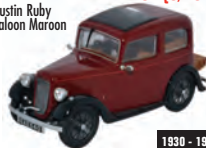
43RUB001 DUE Q3/2017 Austin Ruby Saloon Maroon