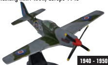
AC060 Mustang MkIV RAAF, Europe 1945