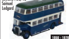
76PD2004 DUE Q3/2017 Leyland PD2/12 Samuel Ledgard