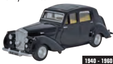
76BN6003 Bentley MkVI Black