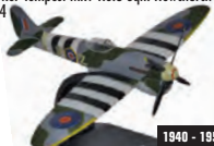
AC062 Hawker Tempest MkV No.3 Sqn. Newchurch 1944