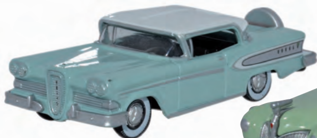
1958 Ford Edsel Citation - Ice Green/Snow White NEW 87ED58005 SCALE 1:87 PRICE £4.75