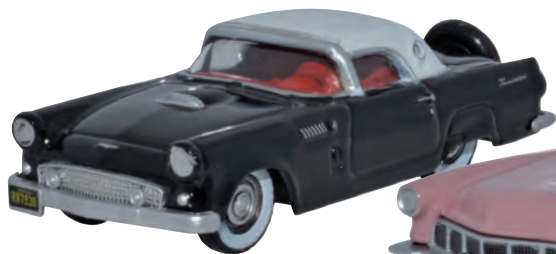
1956 Ford Thunderbird - Raven Black/Colonial White NEW 87TH56006 SCALE 1:87 PRICE £4.95