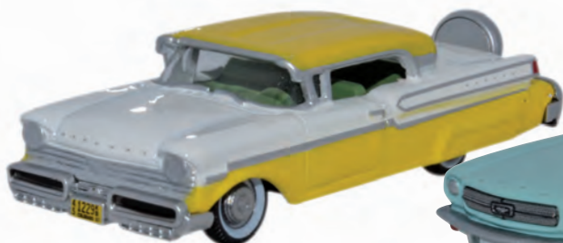
1957 Mercury Turnpike - Moonmist Yellow/Classic White NEW 87MT57002 SCALE 1:87 PRICE £4.95