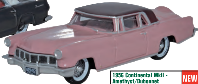
1956 Continental MkII - Amethyst/Dubonnet NEW 87LC56002 SCALE 1:87 PRICE £4.95