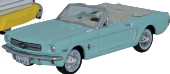
1965 Ford Mustang Convertible - Tropical Turquoise NEW 87MU65002 SCALE 1:87 PRICE £4.95