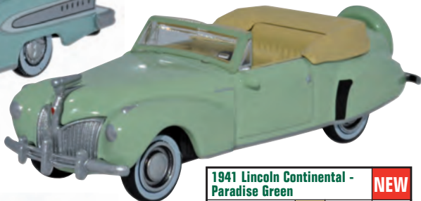
1941 Lincoln Continental - Paradise Green NEW 87LC41005 SCALE 1:87 PRICE £4.95