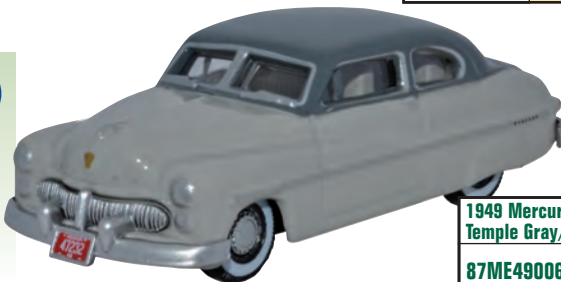
1949 Mercury - Temple Gray/Dakota Gray NEW 87ME49006 SCALE 1:87 PRICE £4.95

Oxford Diecast, PO Box 636, Southampton SO14 0TJ TEL: 02380 248850 www.oxforddiecast.co.uk