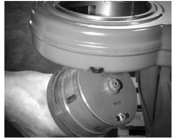
Both the TMPDA and VOKUCLUTCH install in the same orientation.