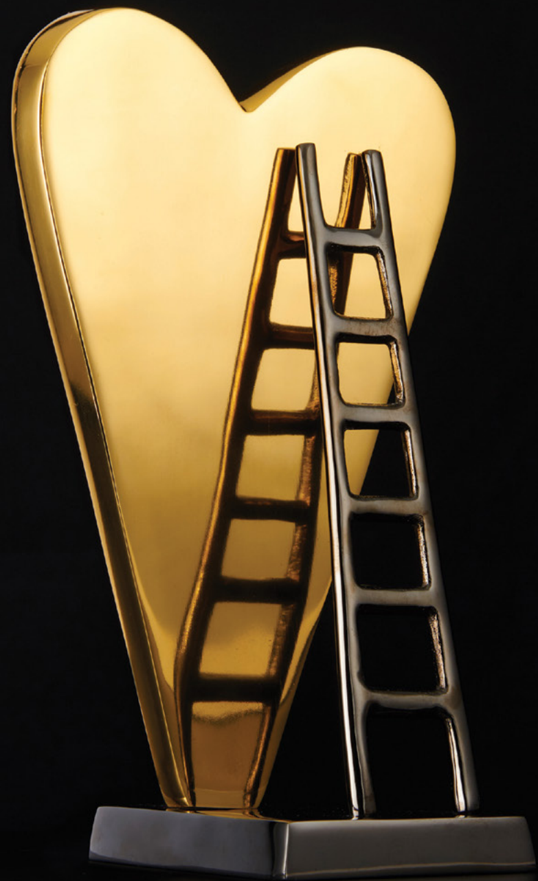
LIMITED EDITION "A HIGHER PLACE" (300 made) 240013 12.5"Hx7.5"Lx3.5"W GOLDPLATE, BLACK NICKEL ALUMINUM

"Love will always take you to great heights"