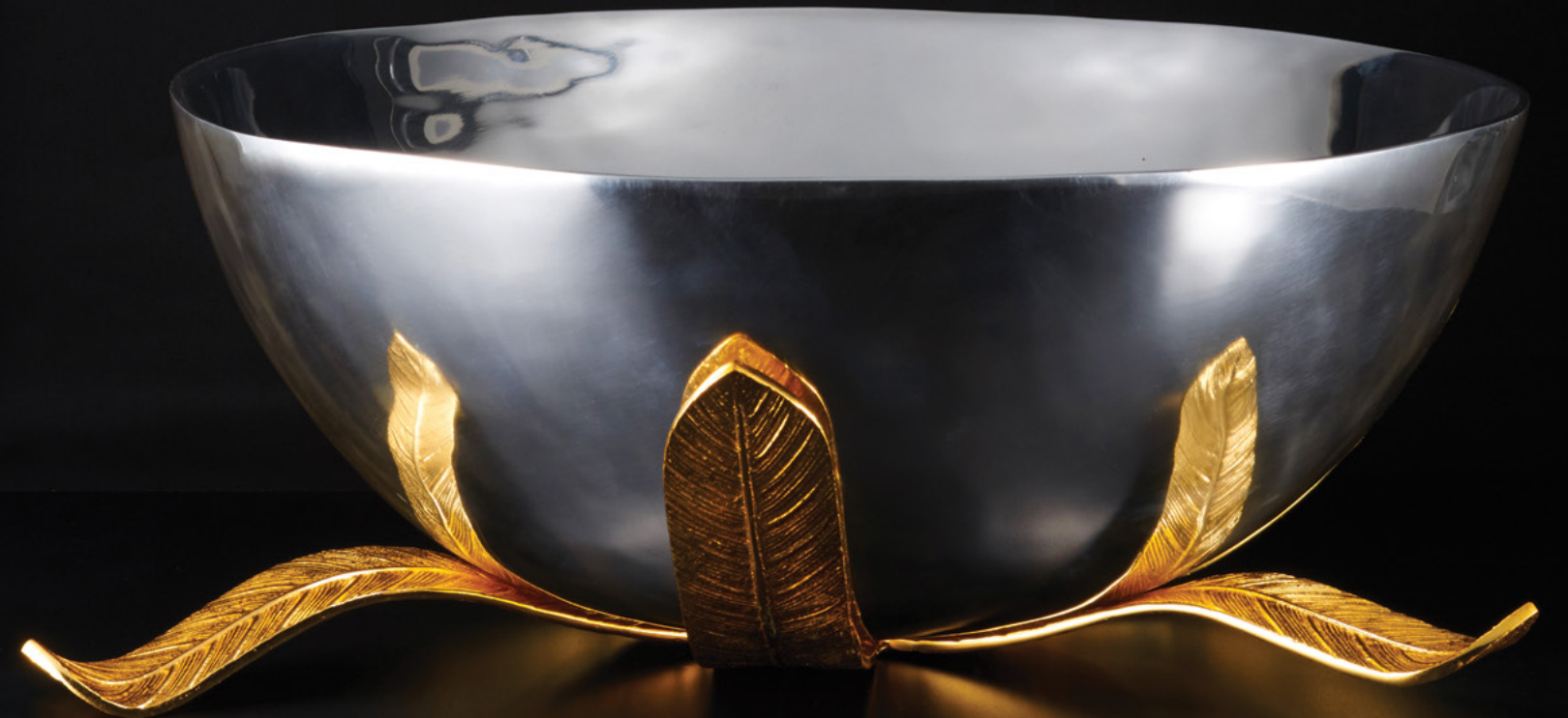
LIMITED EDITION "FEATHERS" (300 made) 120052 9.5"Hx25"Lx25.5"W GOLDPLATE, POLISHED ALUMINUM

Majestic feathers uplift this vessel. Pure, simple, noble.