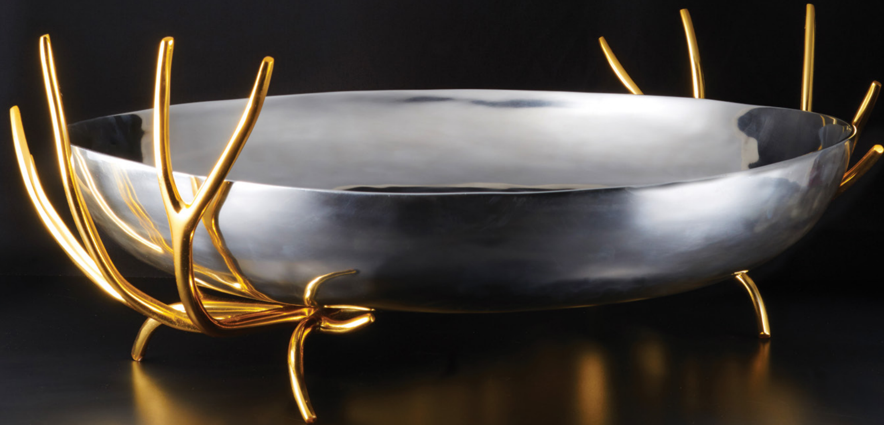
LIMITED EDITION "MANZANITA" (300 made) 110049 10.5"Hx28"Lx25.5"W GOLDPLATE, POLISHED ALUMINUM

The California manzanita tree thrives and becomes even more dramatically beautiful, the less water it gets. There is a lesson in there.