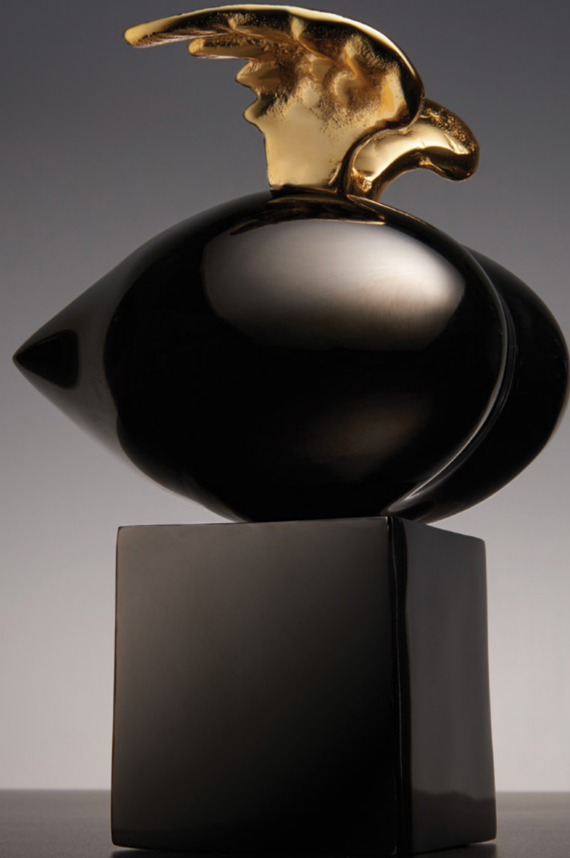
LIMITED EDITION "HEART WITH WINGS" (300 made) 250045 8.25"Hx5"Lx6.75"W GOLDPLATE, BLACK NICKEL ALUMINUM

Set up high on a pedestal, the winged heart represents a love that is free and open to receiving.