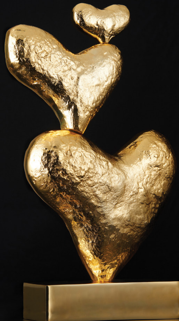
LIMITED EDITION "SOARING HEARTS" (300 made) 240014 18"Hx10.5"Lx3.5"W GOLDPLATE ALUMINUM