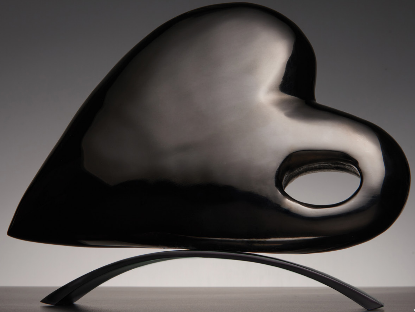
LIMITED EDITION "A HOLE IN MY HEART" (300 made) 250043 12"Hx14"Lx4"W BLACK NICKEL ALUMINUM

Voluptuous and full of meaning, the vulnerability of love is captured in this sculpture. Whether current or past, this heart says more than words.