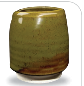
PC-34 Light Sepia over PC-61 Textured Amber