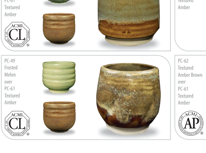
PC-36 PC-43 Ironstone Toasted over Sage PC-61 over Textured PC-61 Amber Textured Amber PC-37 PC-45 Smoked Dark Green Sienna over over PC-61 PC-61 Textured Textured Amber Amber PC-39 PC-46 Umber Float Lustrous over Jade PC-61 over Textured PC-61 Amber Textured Amber PC-42 PC-48 Seaweed Art Deco over Green PC-61 over Textured PC-61 Amber Textured Amber PC-49 The Art & Creative Materials Institute AP (Approved Product) seal certifies this product to be safe for use