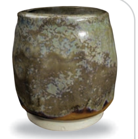
PC-32 Albany Slip Brown* over PC-61 Textured Amber