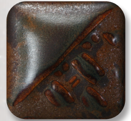
SW-175 Rusted Iron