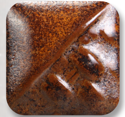
SW-175 Rusted Iron