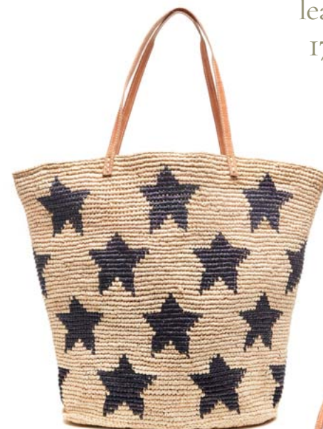
Estrella Tote 8449-STAR

Crocheted raffia carryall with cotton lining, snap closure, and leather straps 17" x 16" x 7"