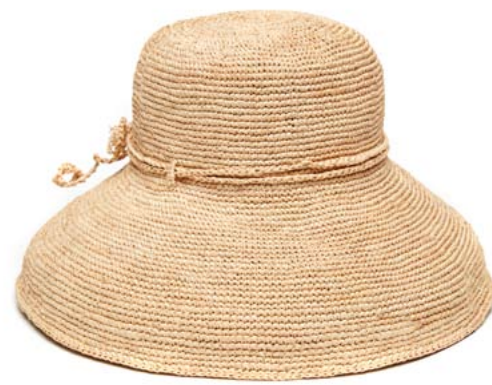
N-Natural SHIPS 10/1