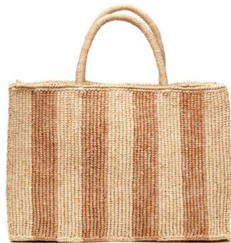
TN-Sand/Natural SHIPS 10/1

W: $79 R: $175 Crocheted raffia carryall 17" x 13" x 8"