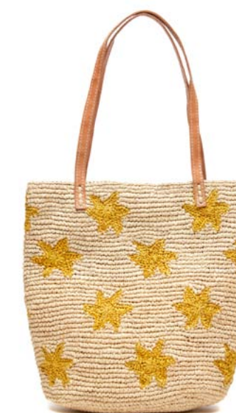
Petite Soleil 8449MINI-SUN

Crocheted raffia mini shoulder tote with cotton lining, snap closure and leather straps 12" x 11" x 4"