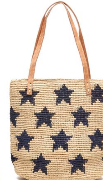
Petite Estrella 8449MINI-STAR