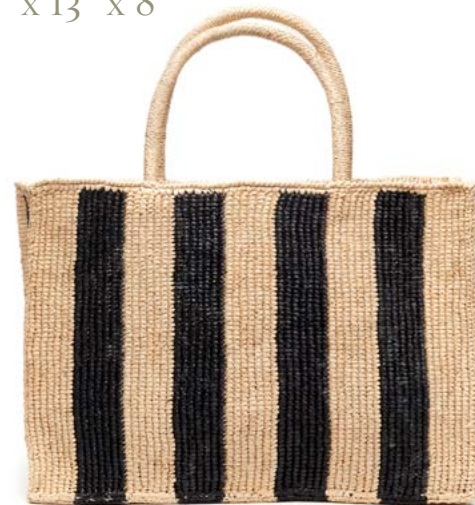
NVN-Navy/Natural SHIPS 10/1