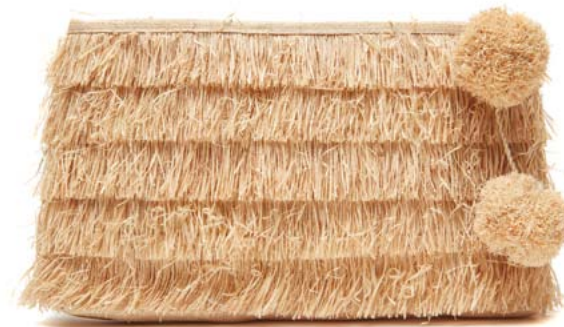
N-Natural SHIPS 10/1