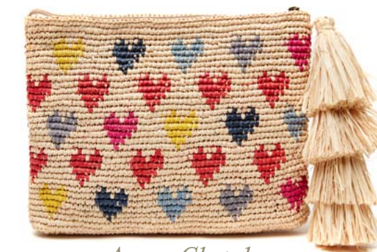
Amor Clutch 8622-AMOR