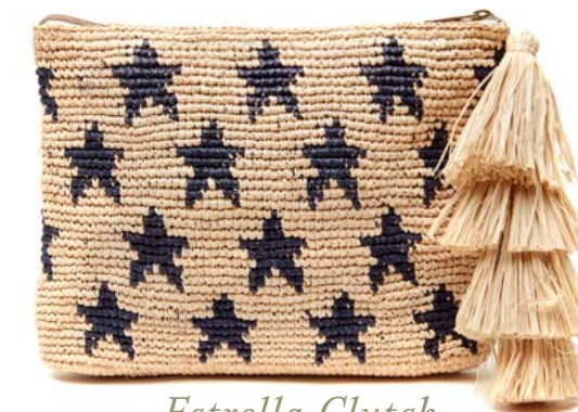
Estrella Clutch 8622-STAR