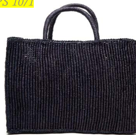
NV-Navy SHIPS 10/1