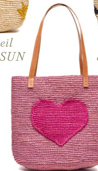
Petite Heart Pocket Tote 8449MINI-HRT