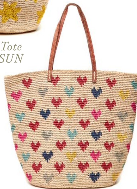
Amelie Tote 8317-MU