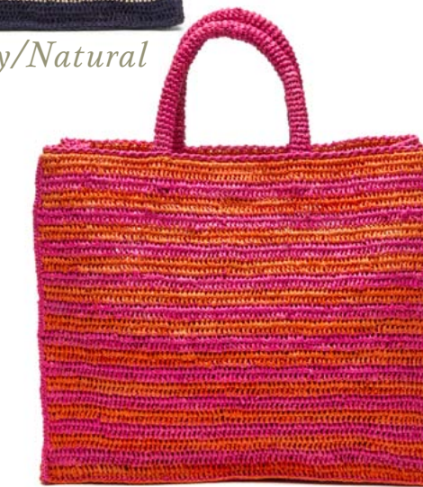
PM - Pink/ Mango