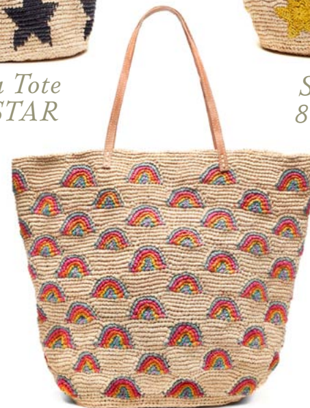
Iris Tote 8449-ARCO