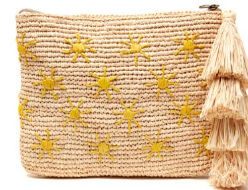
Soleil Clutch 8622-SUN

Crocheted raffia clutch with cotton lining, tassel, and zip closure 10.5" x 8" x 1"