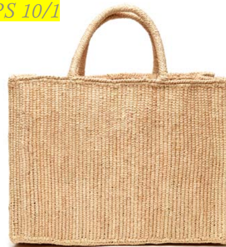
N- Natural SHIPS 10/1