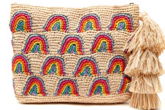
Iris Clutch 8622-ARCO