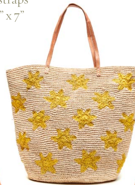
Soleil Tote 8449-SUN