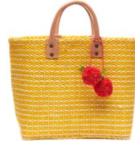
S-Sunflower SOLD OUT