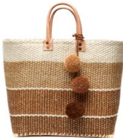
T-Sand SOLD OUT