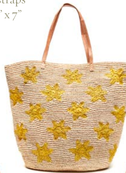
Soleil Tote 8449-SUN