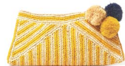
S-Sunflower SOLD OUT

Crocheted clutch with cotton lining, pom poms, and zip closure 12" x 6"