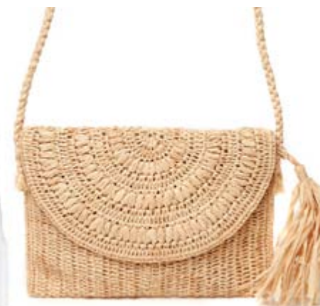
N-Natural SOLD OUT