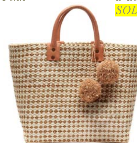
T-Sand SOLD OUT