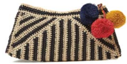
BLK-Black SOLD OUT