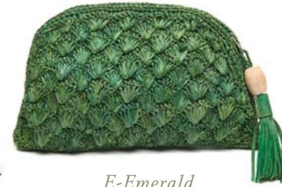
E-Emerald SOLD OUT