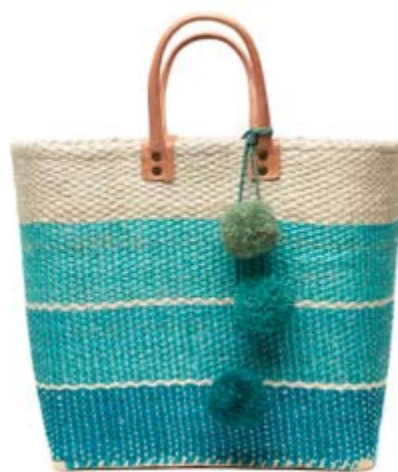
AQ-Aqua SOLD OUT