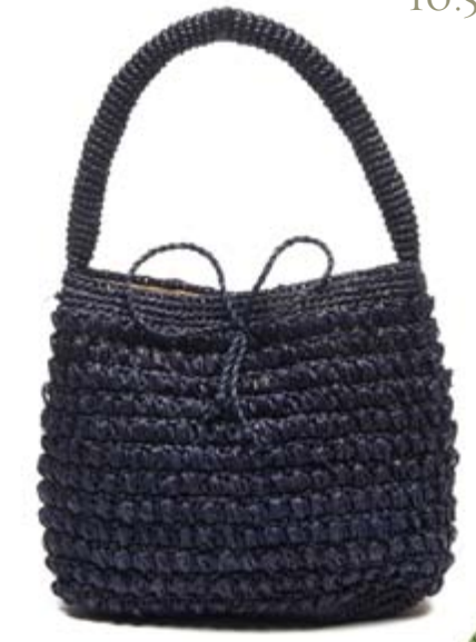
NV-Navy SOLD OUT

Crocheted raffia satchel with cotton lining and snap closure 10.5" x 9" x 4.5"