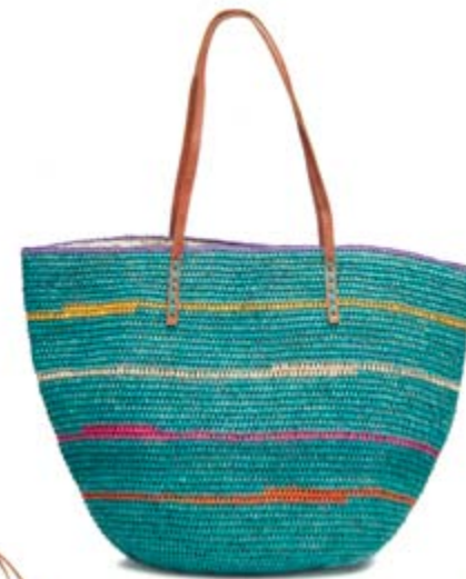
AQ-Aqua SOLD OUT