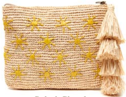
Soleil Clutch 8622-SUN

Crocheted raffia clutch with cotton lining, tassel, and zip closure 10.5" x 8" x 1"