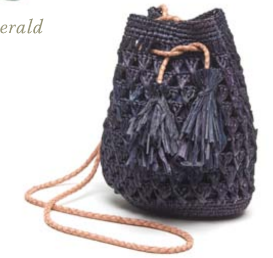
NV-Navy SOLD OUT