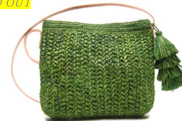
E-Emerald SOLD OUT