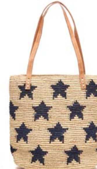
Petite Estrella 8449MINI-STAR