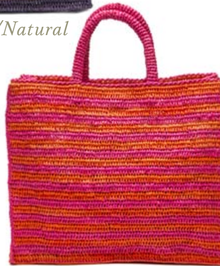
PM - Pink/ Mango