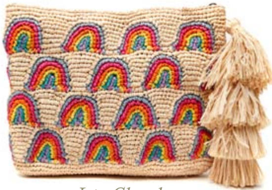
Iris Clutch 8622-ARCO