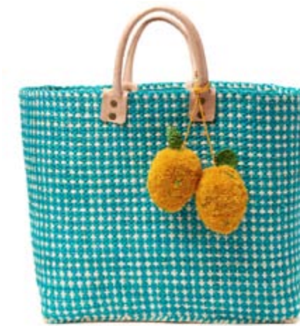
AQ-Aqua SOLD OUT