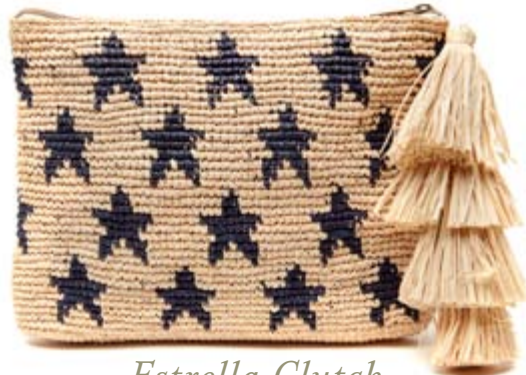
Estrella Clutch 8622-STAR