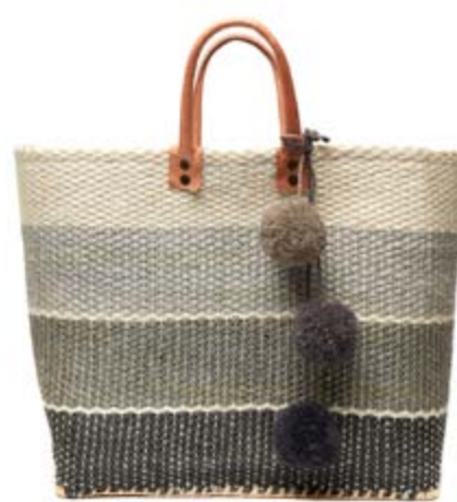
D-Dove SOLD OUT