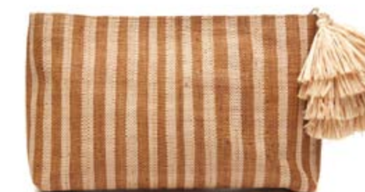
T-Sand SOLD OUT