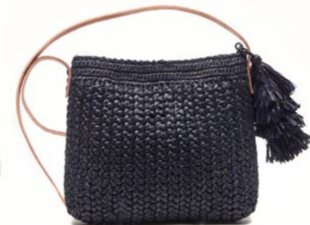
NV-Navy SOLD OUT

Crocheted raffia crossbody with cotton lining, leather strap, snap closure and tassel 10" x 8.5" x 2.5"