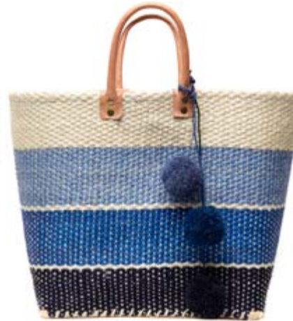
NV-Navy SOLD OUT