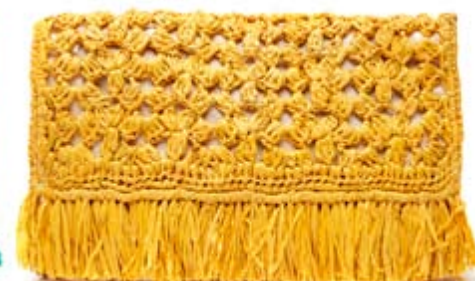
S-Sunflower SOLD OUT