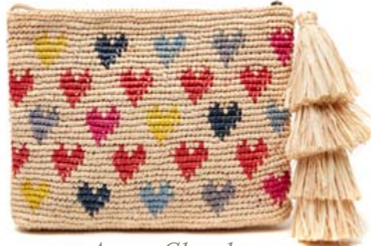
Amor Clutch 8622-AMOR