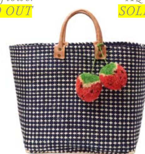
NV-Navy SOLD OUT