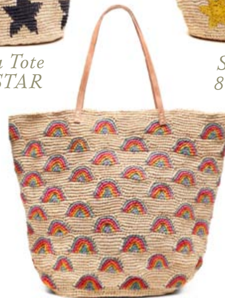
Iris Tote 8449-ARCO