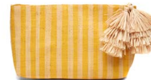
S-Sunflower SOLD OUT

Woven raffia clutch with cotton lining, zip closure and tassel 12" x 8" x 2"