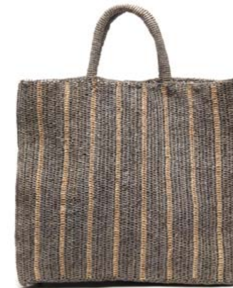
DN-Dove SOLD OUT

Crocheted raffia carryall with snap closure 17.5"x 16.5" x 6"