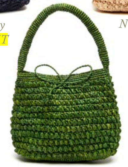
E-Emerald SOLD OUT