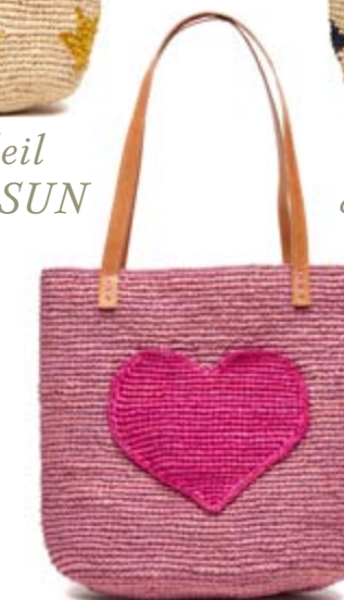
Petite Heart 8449MINI-HRT