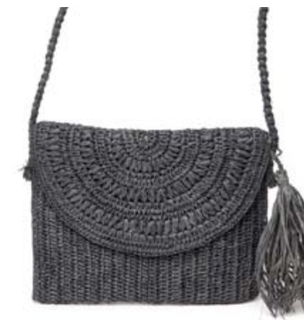
D-Dove SOLD OUT