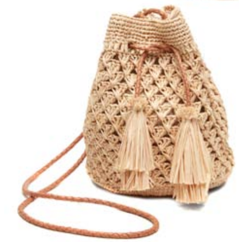
N-Natural SOLD OUT