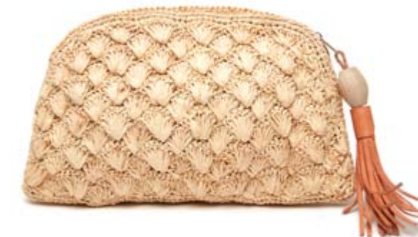
N-Natural SOLD OUT

Crocheted raffia clutch with cotton lining, zip closure and leather tassel 11" x 6.5" x 2"