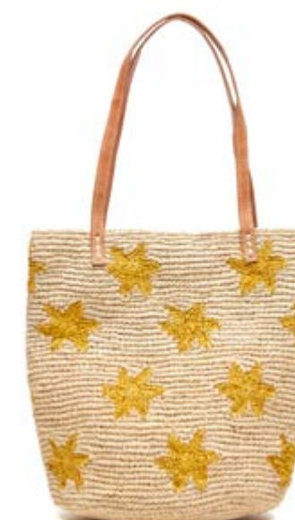
Petite Soleil 8449MINI-SUN

Crocheted raffia mini shoulder tote with cotton lining, snap closure and leather straps 12" x 11" x 4"