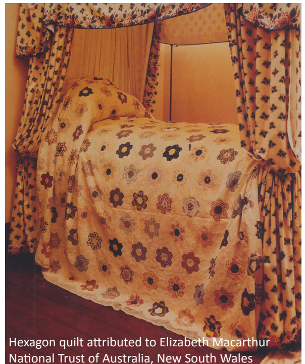
Hexagon quilt attributed to Elizabeth Macarthur National Trust of Australia, New South Wales