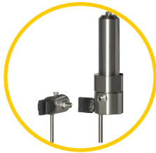
HP Filter & Release Combo