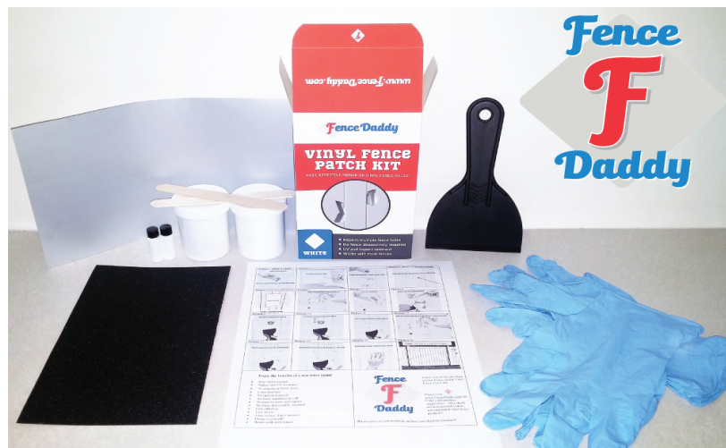
(Includes everything needed to get the job done!)