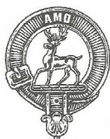
C97 SCOTT 'I LOVE'