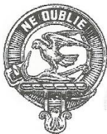
C29 GRAHAM 'DO NOT FORGET'