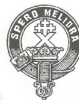
C85B MOFFAT 'I HOPE FOR BETTER THINGS'