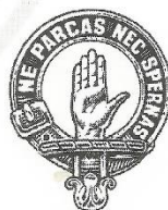
C40 LAMONT 'NEITHER SPARE NOR DISPOSE'