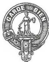
C86 MONTGOMERY 'LOOK WELL'