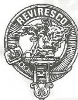
C84 MAXWELL 'I FLOURISH AGAIN'