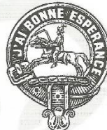
C13B CRAIG of Wester Dunmore 'I HAVE GOOD HOPE'