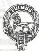
C6B BRUCE 'WE HAVE BEEN'