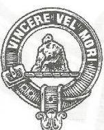
C76 MacNEIL 'TO CONQUER OR DIE'