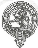
C55 MacDUFF of Banhard 'GOD ASSISTS'