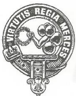
C100 SKELNE 'A PALACE TO THE REWARD OF BRAVERY'