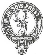
C26 FRASER of Lovat 'I AM READY'