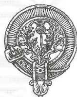
C113 SCOTS THISTLE