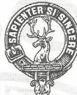
C16 DAVIDSON of Tulloch 'WISELY IF SINCERELY'