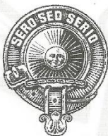
C39 KERR 'LATE BUT IN FARNEST'