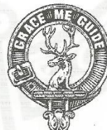
C25 FORBES 'GRACE ME GUIDE'