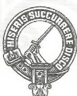
C73 MacMILLAN 'I LEARN TO SUCCOUR THE DISTRESSED'