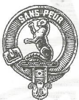
C103 SUTHERLAND 'WITHOUT FEAR'