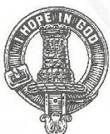
C75 MacNAUGHTON 'I HOPE IN GOD'