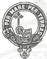
C50 MacDONALD of the Isles 'BY SEA AND BY LAND'