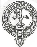
C56 MacEWAN 'I GROW GREEN'