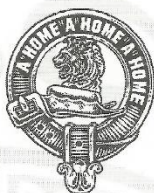
C34B HOME 'A HOME A HOME A HOME'