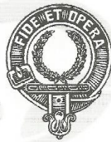
C46 MacARTHUR 'BY FIDELITY AND LABOUR'