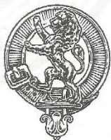
C191 RAMPANT LION