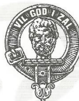
C85 MENZIES 'WITH GOD'S WILL, I SHALL'