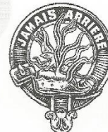
C17 DOUGLAS 'NEVER BEHIND'