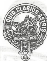
C2B BAILLIE of Lamington 'WHAT IS BRIGITER THAN THE STARS'