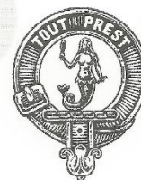
C89 MURRAY of Atholl 'QUITE READY'