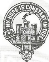
C51 MacDONALD of Clanranald 'MY HOPE IS CONSTANT IN THEE'