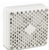
450E shown with included panel mount gasket

WB-NM – Molded thermoplastic neoprene-gasketed weatherproof housing for outside use, complete with mounting lugs; provided with (3) entrances for 1/2" conduit; 4-3/8" square box; 2-7/16" deep, offset mounting lugs on 5" centers; shipping weight 1 lb (0.45kg)