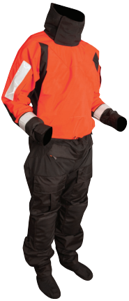
BOAT CREW DRY SUIT MSD634 / MSD635 (with drop-seat)

Our Sentinel dry suits are in use by US Coast Guard and validated by NAVAIR, SAR Model Manager Office, Naval Special Warfare and water rescue professionals.