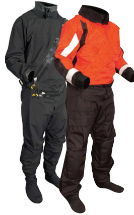
HEAVY DUTY BOAT CREW DRY SUIT MSD644 / MSD645 (with drop-seat)

This standard boat crew dry suit is ideal for regular duty and provides 1050 Denier Ballistic Nylon reinforcement in high wear areas such as the knees, elbows and seat.