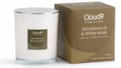
Sandalwood & White Musk