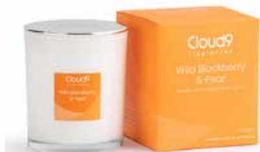
Wild Blackberry & Pear