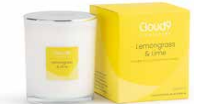
Lemongrass & Lime