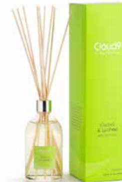
Guava & Lychee