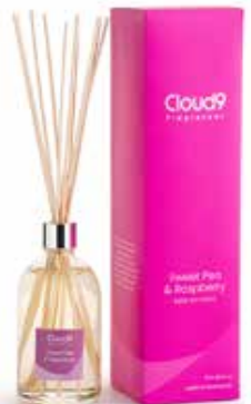
Sweet Pea & Raspberry