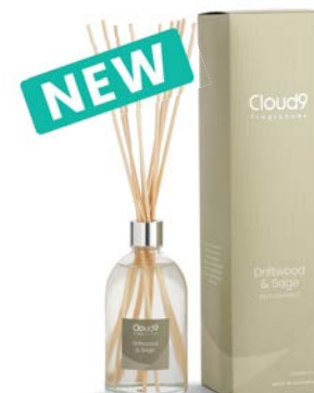
Driftwood & Sage