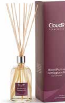
Blood Plum & Pomegranate