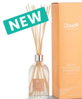
Apricot, Blood Orange & Persimmon