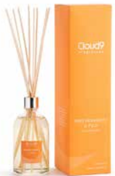
Wild Blackberry & Pear