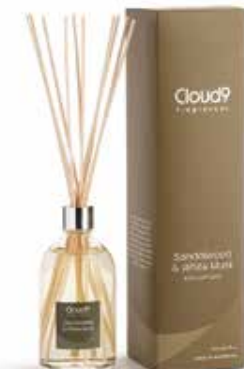
Sandalwood & White Musk