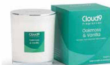
Oakmoss & Vanilla