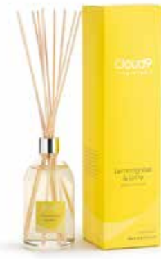
Lemongrass & Lime