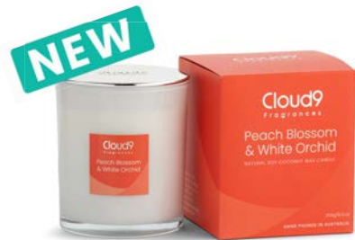
Peach Blossom & White Orchid