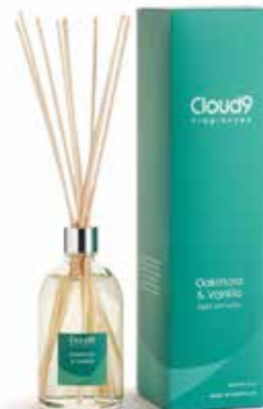
Oakmoss & Vanilla