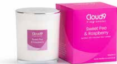
Sweet Pea & Raspberry