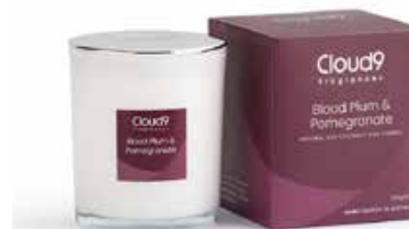
Blood Plum & Pomegranate