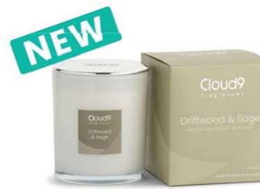
Driftwood & Sage