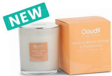
Apricot, Blood Orange & Persimmon