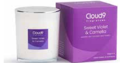
Sweet Violet & Camelia