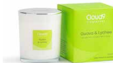
Guava & Lychee