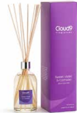
Sweet Violet & Camelia