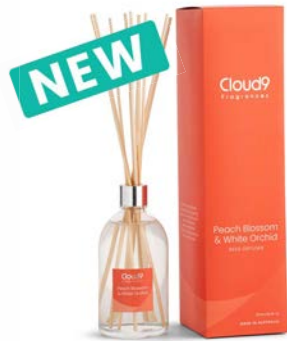
Peach Blossom & White Orchid