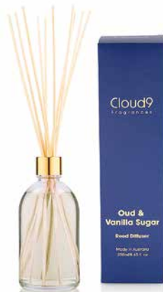
Oud & Vanilla Sugar