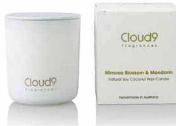
Mimosa Blossom & Mandarin