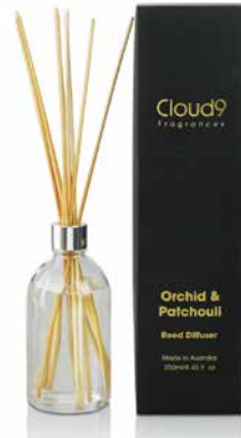
Orchid & Patchouli