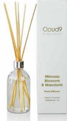
Mimosa Blossom & Mandarin