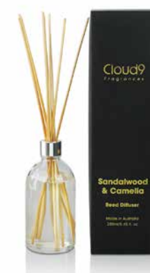
Sandalwood & Camelia