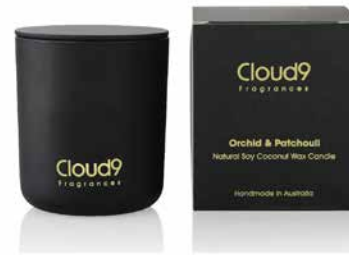
Orchid & Patchouli