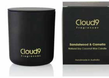
Sandalwood & Camelia