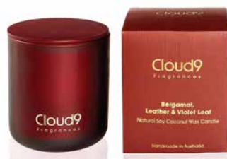
Bergamot, Leather & Violet Leaf