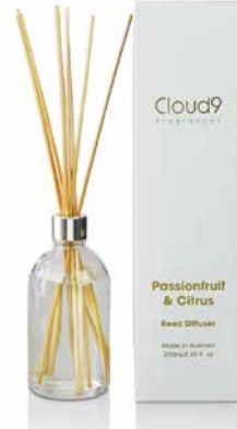
Passionfruit & Citrus