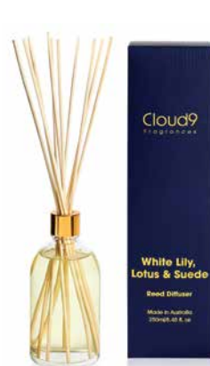
White Lily, Lotus & Suede