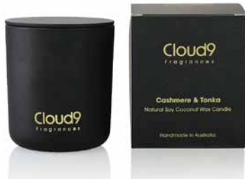
Cashmere & Tonka