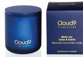
White Lily, Lotus & Suede