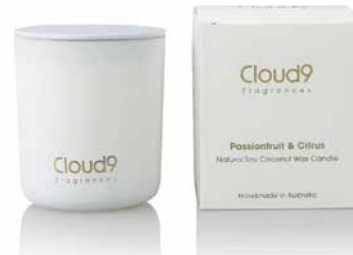
Passionfruit & Citrus