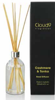
Cashmere & Tonka