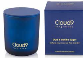
Oud & Vanilla Sugar