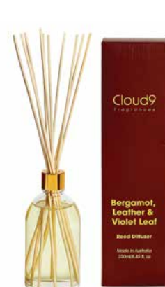
Bergamot, Leather & Violet Leaf