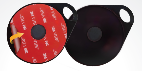
We recommend letting the Dashboard pad sit for 2 hours Before applying

D.Peel protective film off the Dashboard pad, and place the sticky side down. press and rub around Dashboard pad to ensure firm adhesive greep