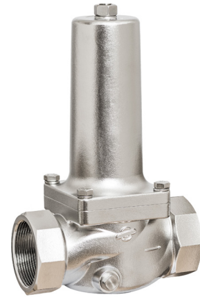
DRV 772 • DRV 778 Type B (DN 40 - DN 80)