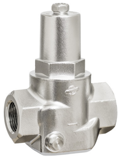
DRV 772 • DRV 778 Type A (DN 15 - DN 32)