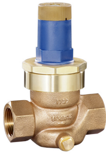
Type A (DN 15 - DN 32)