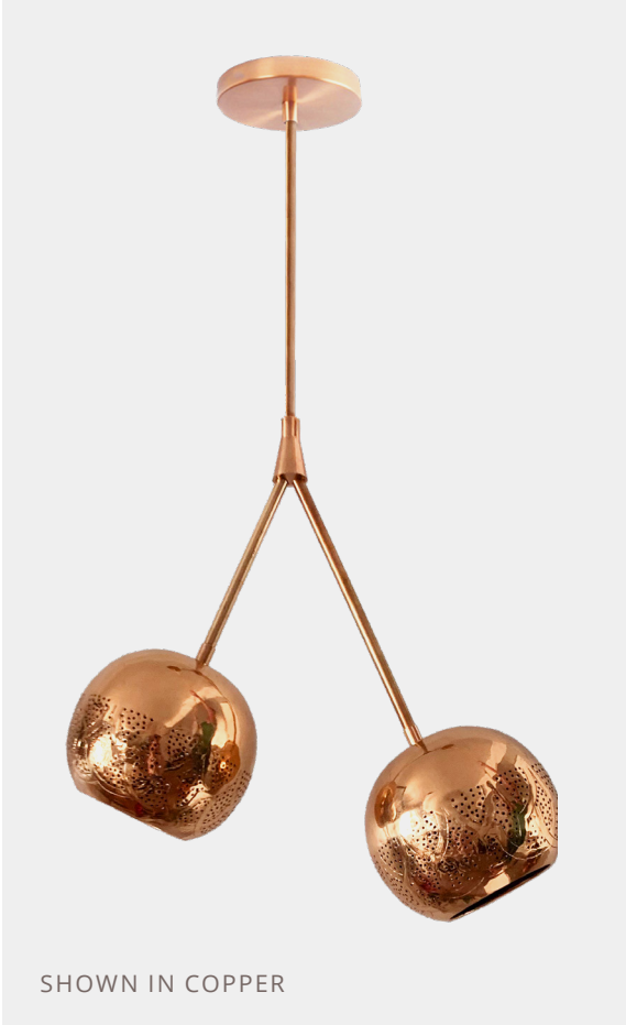
SHOWN IN COPPER

The Nur double pendant light is a perfect example of traditional Moroccan craftsmanship meeting modern forms. Suspended from one stem, its two metal globes prove that asymmetry can be achieved through simplicity and minimalism. The Nur double pendant Light is ideal for modern living and dining rooms, home offices, as well as hospitality spaces.