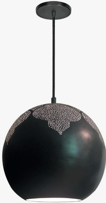
SHOWN IN GUNMETAL

The stunning trellis pattern at the top of Najma directs all focus to this exquisite pendant light. Najma casts brilliant shadows onto the ceiling while creating a focused light at the base, making it the perfect addition to dining and living spaces.